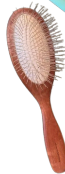
TAURO PRO LINE BRUSH, PEAR WOOD 27 MM TEETH