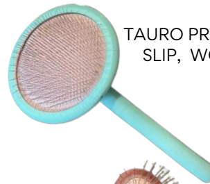
TAURO PRO LINE ERGONOMIC NON-SLIP, WOODEN ROUND SLICKER