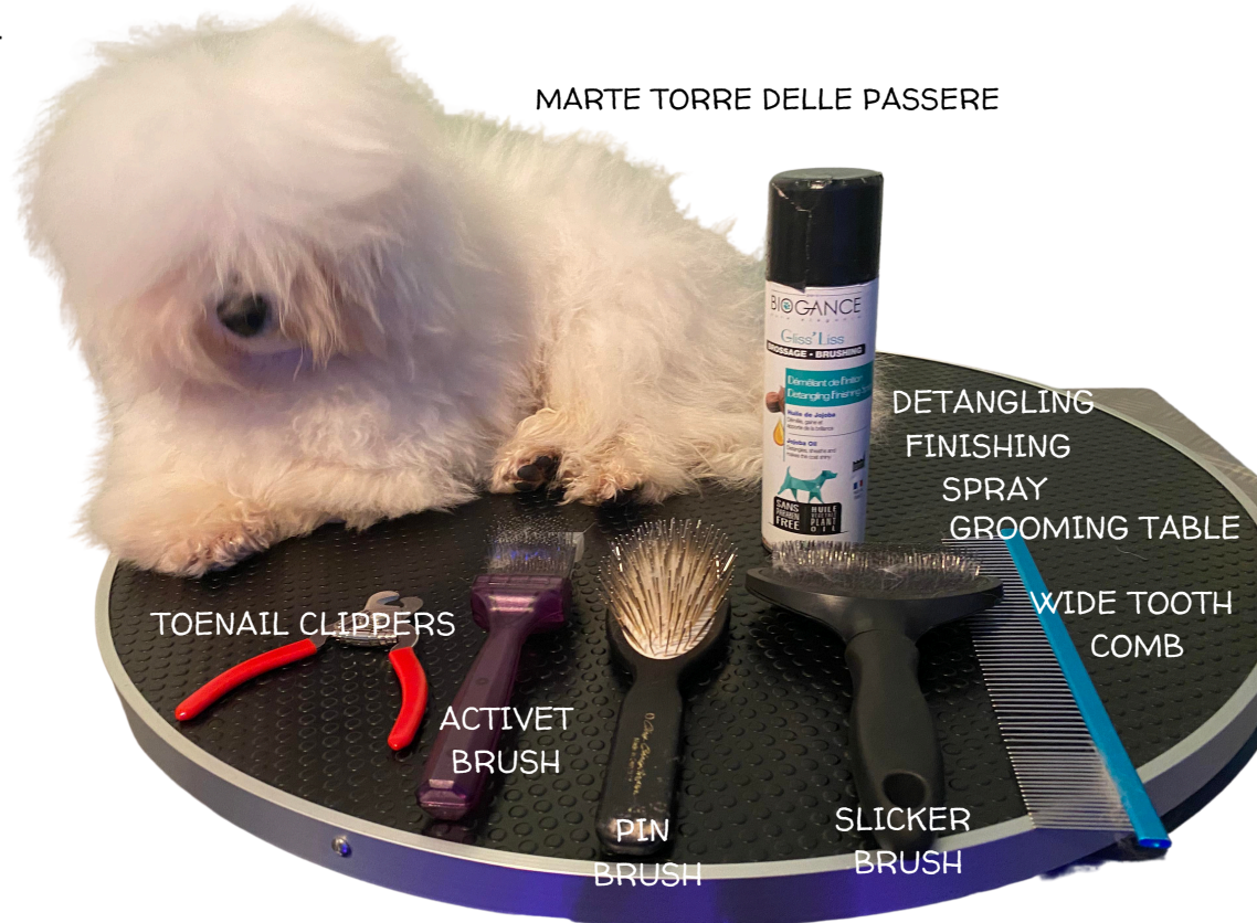
MARTE TORRE DELLE PASSERE

While air-drying produces the desirable exhibition "curls," it also increases the likelihood of knots. Therefore, Jessie advises brushing and blow-drying the coat for easier maintenance between shows.