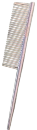
TAURO PRO LINE COMB METALLIC, WITH TAIL