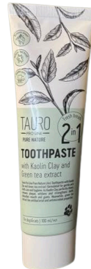
TAURO PURE NATURE 2-N 1 TOOTHPASTE