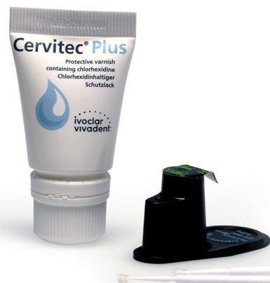
FIGURE 1: Cervitec Plus is available in the forms of a dispensing tube and single dose.

Biofilm-focused care includes the addition of an antimicrobial varnish. There is currently only one available on the market, Cervitec Plus (Ivoclar Vivadent; figure 1). It is recommended for prevention of biofilm formation around any implants, natural teeth, orthodontic bands, and crown and bridge restorations. Other applications include any inflammation present, recession, gingivitis, mucositis, and as an adjunct of periodontal disease treatment.