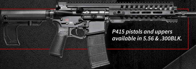
P415 pistols and uppers available in 5.56 & .300BLK.

The reliability has been tested time after time, and the operating system perfected. E 2 Extraction Technology, complete ambidextrous fire controls, modular free floating rail platform, and numerous internal improvements make it the pinnacle of all-purpose 5.56 caliber sporting rifles. The P415 simply will not fail when you need it most.