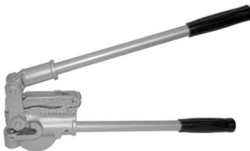
NO. 7A Bench Mounting Base

Furnished with 7/32" punch and die. No Substitutions on punch and die unless 12 or more tools ordered.