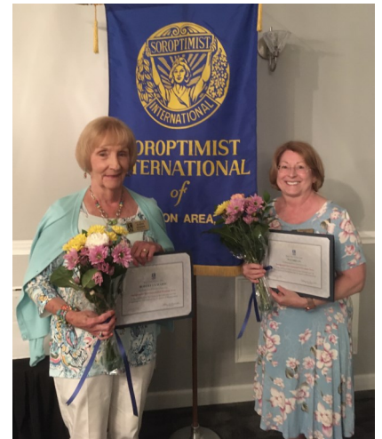
Members being pinned