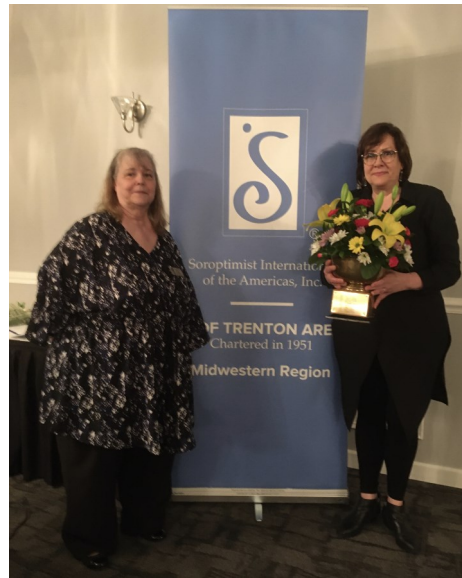
Soroptimist of the Year