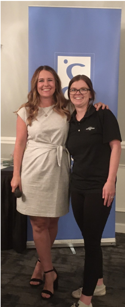
“Rookie of the Year” & “Key Member”