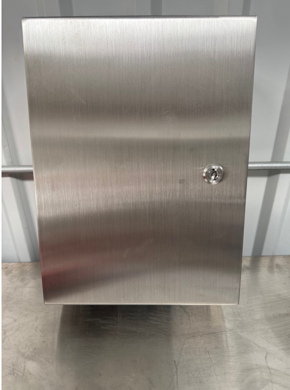
Stainless Steel Enclosure

Industrial-grade, weather-resistant housing