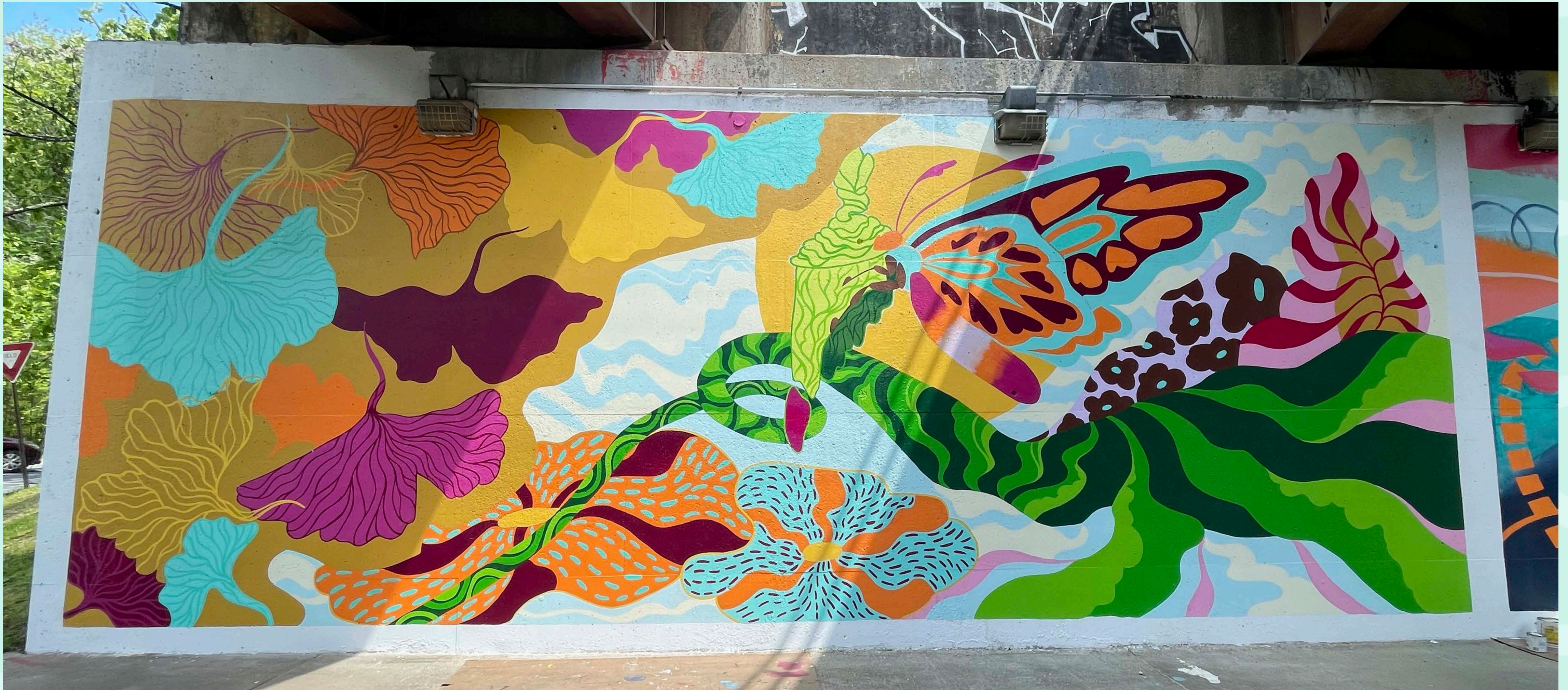
2024 | Living Walls Atlanta - "Changing into the Better Me" - Latex on Concrete - 16' x 34'