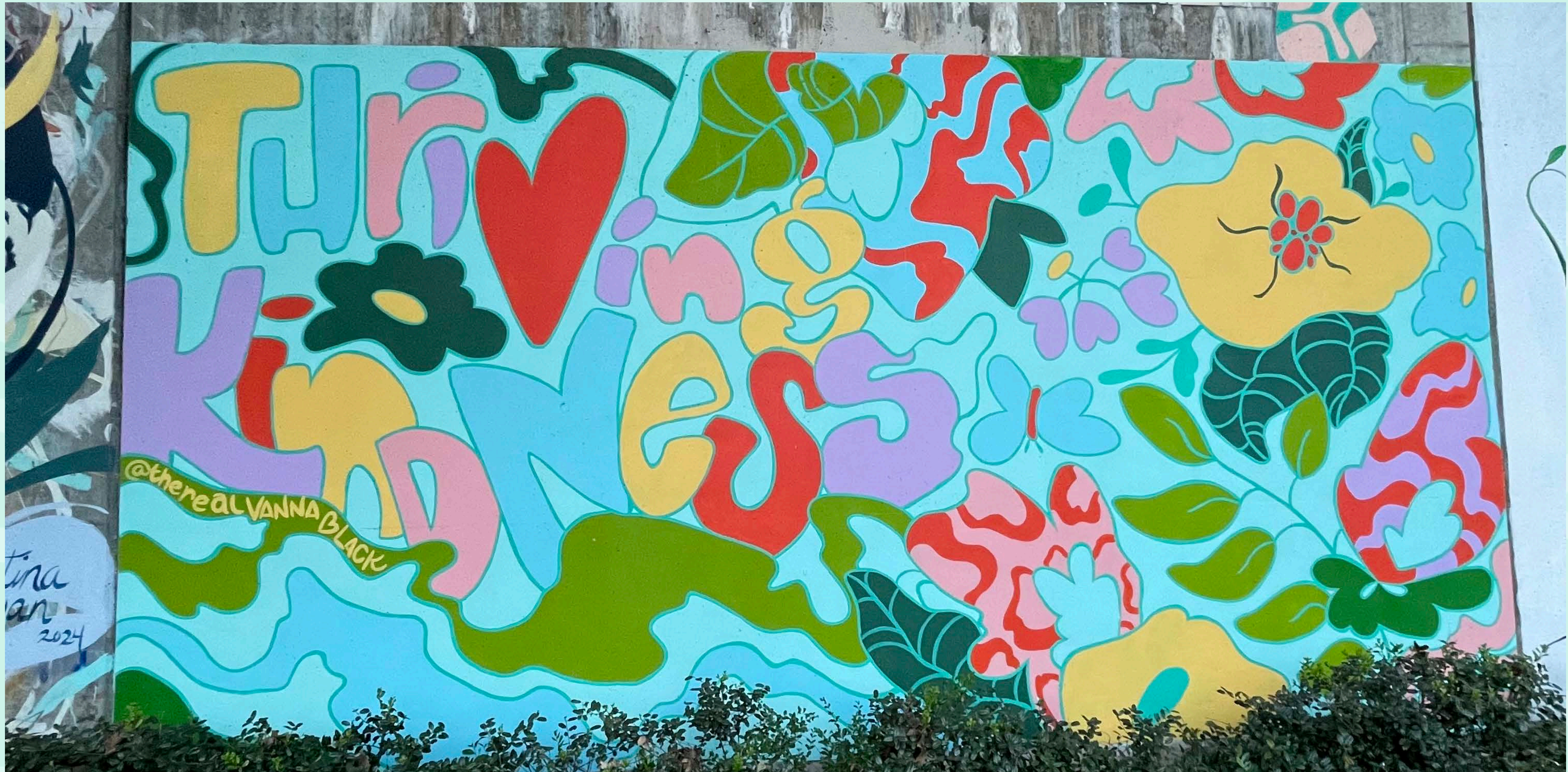
2024 | Forward Warrior Atlanta - "Thriving Kindness" - Latex on Concrete - 14' x 32'