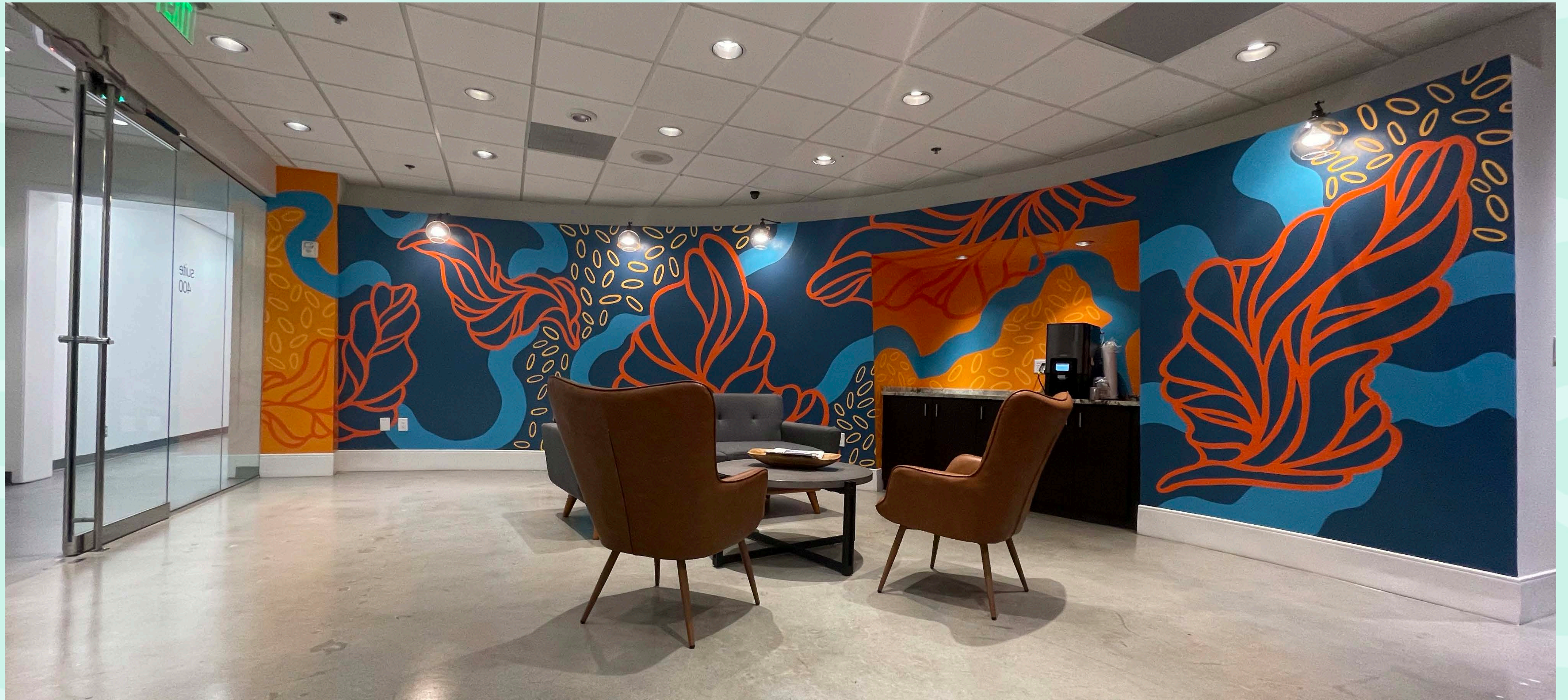
2024 | Foundry Commercial @ Piedmont Place - "Flowing Chattahoochee" - 8.5' x 38'