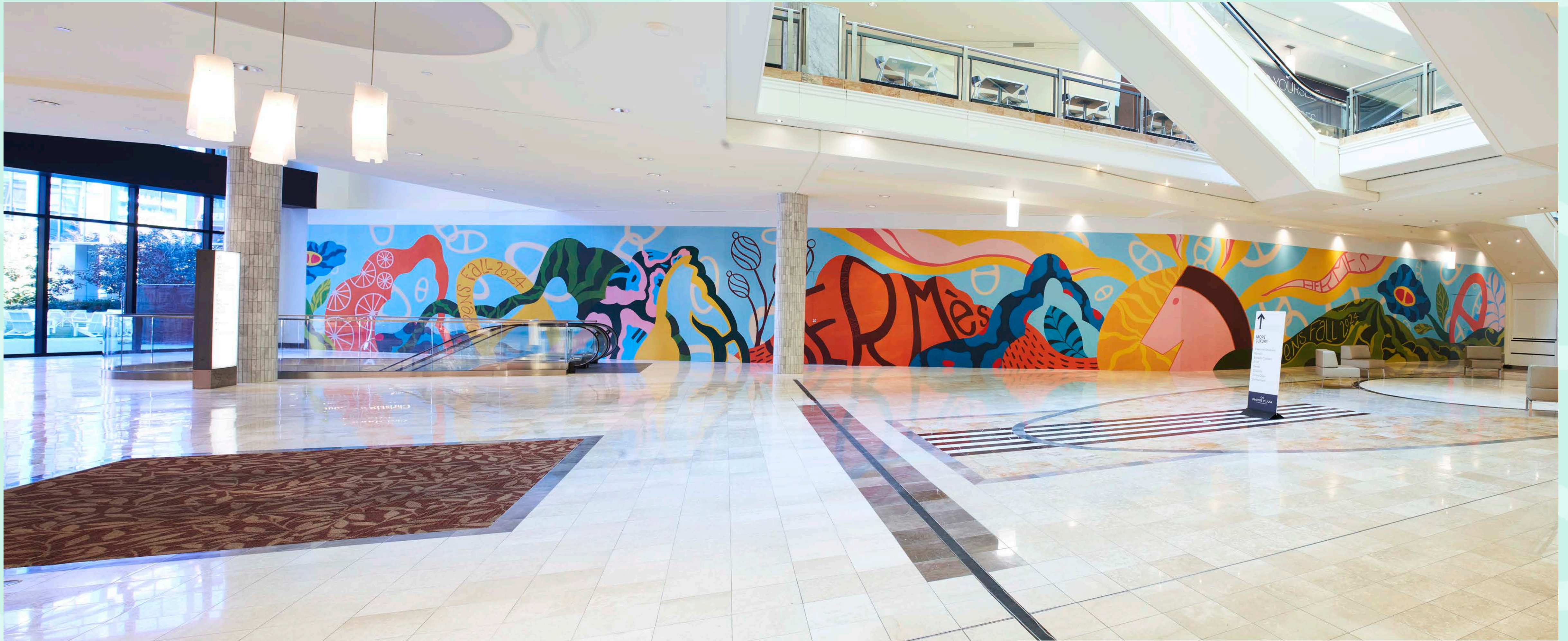
2024 | Hermès - "Chaine d'Ancre in The Sky" | Acrylic on Wood Panel - 12' x 144'