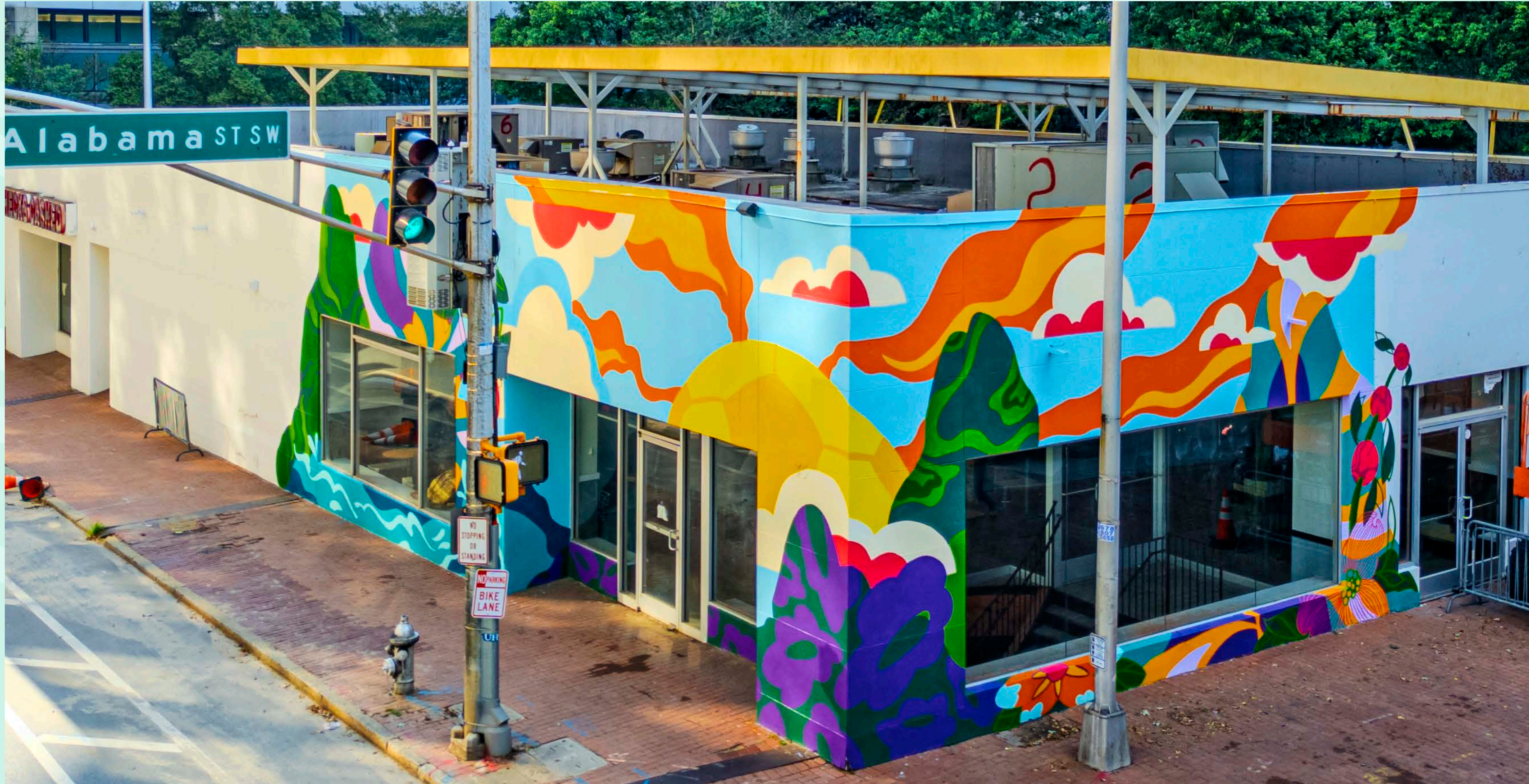
2025 | ATL Downtown Improvement District - "Play Outside, Atlanta!" - Latex on Concrete - 23' x 54'