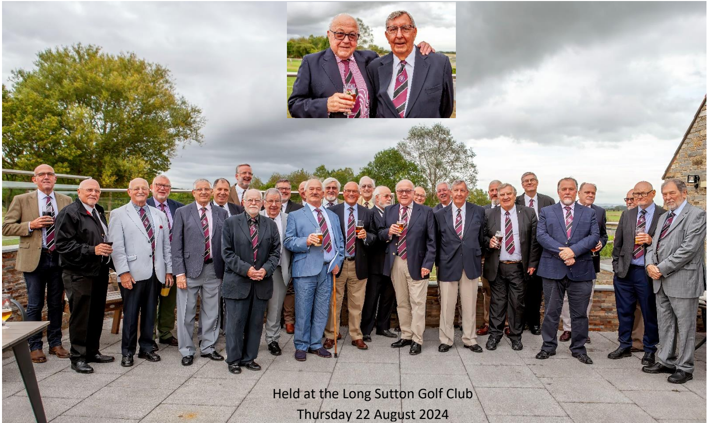
Held at the Long Sutton Golf Club Thursday 22 August 2024

The Provincial Officers Dinner was this year held at the Long Sutton Golf Club. Twenty-nine Knights of all Eminences attended to celebrate the success of the past year and to introduce the designated Officers for next year to their predecessors, and hopefully for them to pass on their enjoyable experiences.