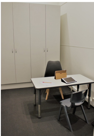
Clinic Room 4 (above left) has been setup as a testing space with soundproofing, an adjustable table and stable chairs for children, adolescents and adults.