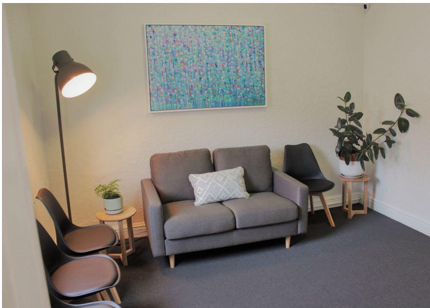
The waiting room is comfortably furnished and away from clinical rooms. Books magazines and a children's play space is to the right. (below middle).

The ground floor welcomes clients to the waiting room through the main entrance, contains staff amenities (kitchen, bathroom), 2 clinic rooms and the group room.