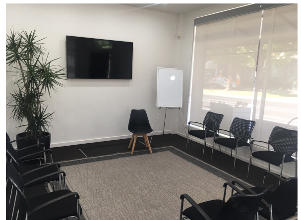
The Group Room can facilitate group therapy, professional meetings and training up to 15 participants.