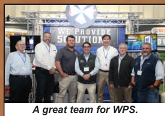
A great team for WPS.