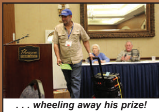
. . . wheeling away his prize!