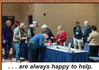
. . . are always happy to help.