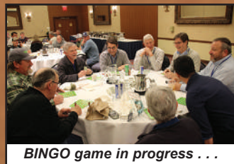
BINGO game in progress . . .