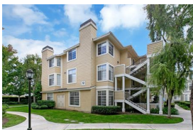
Aliso Viejo • Map

9 days on the market • Sold On 11/13/2018