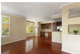
Aliso Viejo • Map

4 days on the market • Sold On 07/31/2018