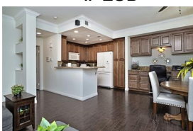
Aliso Viejo • Map

39 days on the market • Sold On 08/27/2018