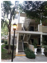
Aliso Viejo • Map

54 days on the market • Listed On 12/20/2018