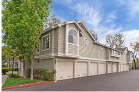
Aliso Viejo • Map

63 days on the market • Sold On 08/07/2018