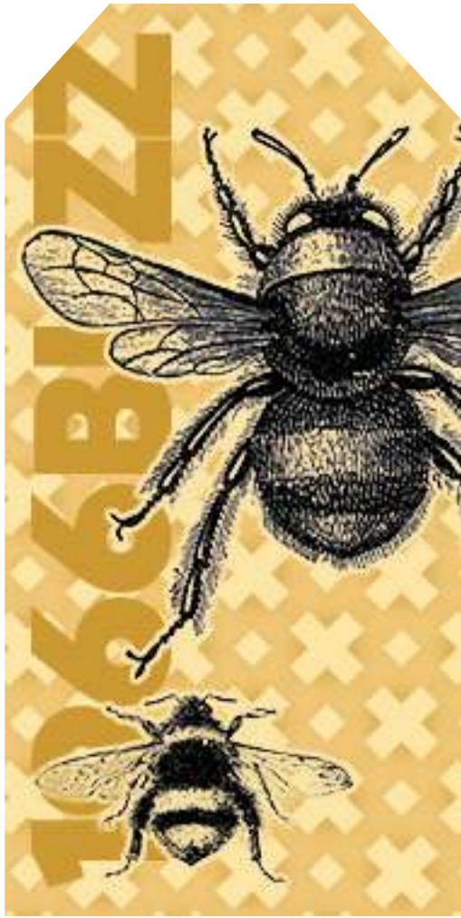
No. 6 Tag - 5.25" X 2.625"