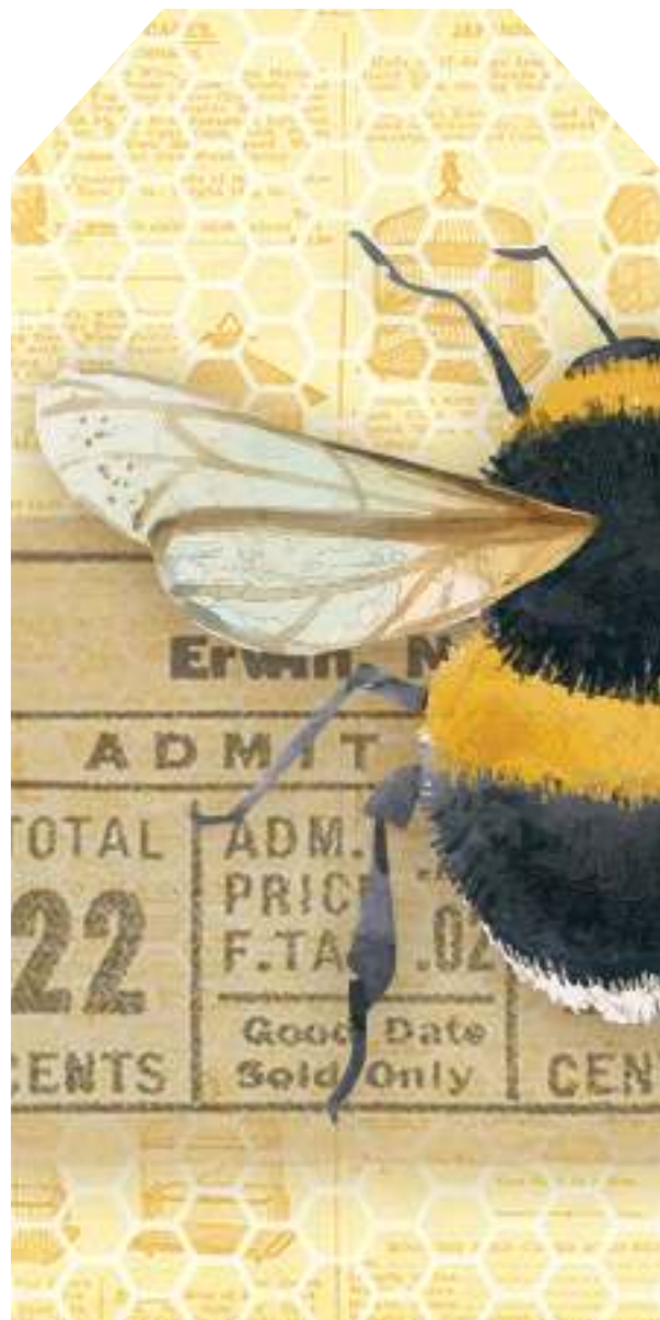
2" X 1" Ticket