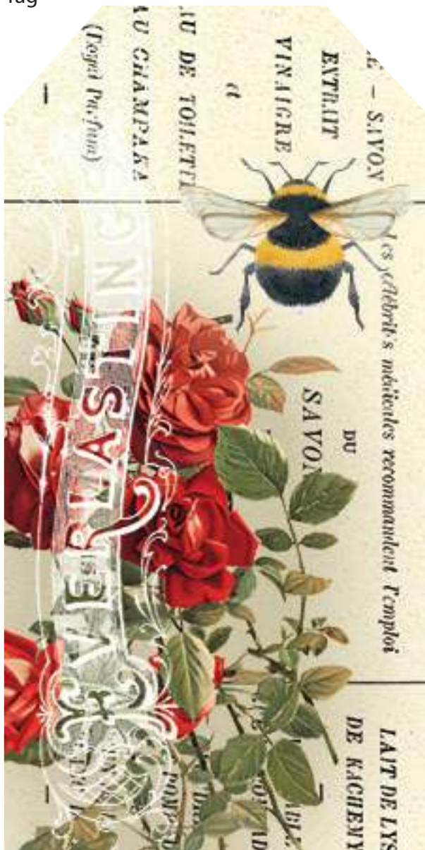
No. 8 Tag