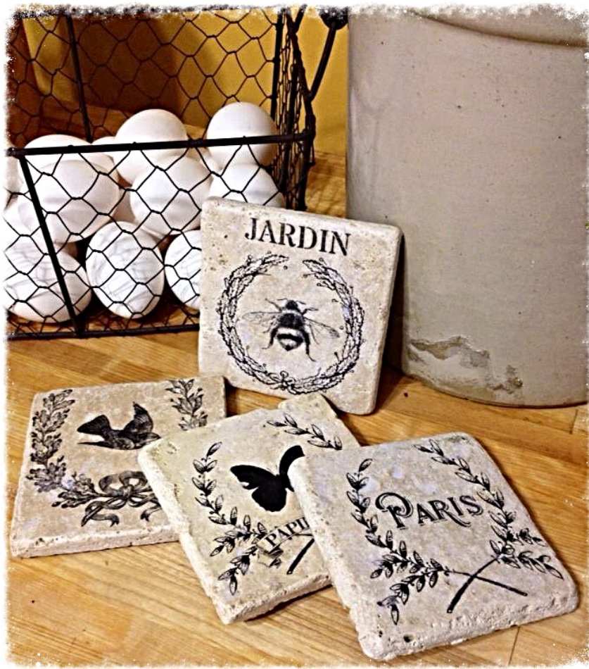
Image Transfer is Not a quick n easy thing, it's a " be a little patient and it'll be even better" thing. This Coaster project is so simple and produces a very professional and high quality finish. I promise you, You will love the results!

DecoArt is always raising the bar and has produced two FABULOUS Image transfer products. DecoArt Americana Decor Image transfer Medium and DecoArt Photo Transfer Medium are both exceptional and work for a variety of surfaces, both painted and unpainted. I also use DecoArt Decoupage Medium for image transfer, it works very well on a variety of surfaces too, But for an item like these coasters I wanted them to hold up long term, so I chose the Americana Decor Image Transfer medium for it's exceptional durability and adhesion.