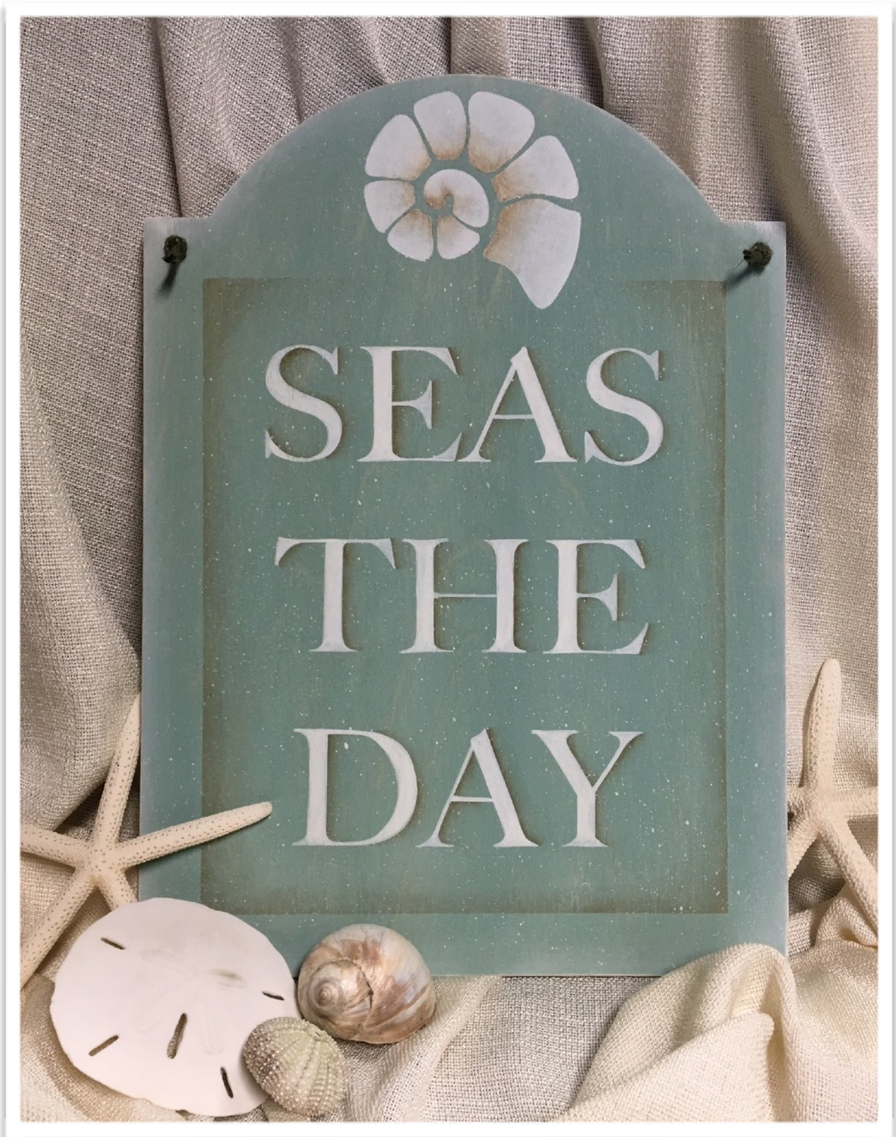
Seas The Day Designed By Tracy Moreau www.tracymoreau.net