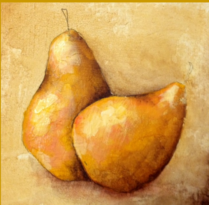
Fig 7: Brighten the highlight by Adding the Mid value of the Indian Yellow mix