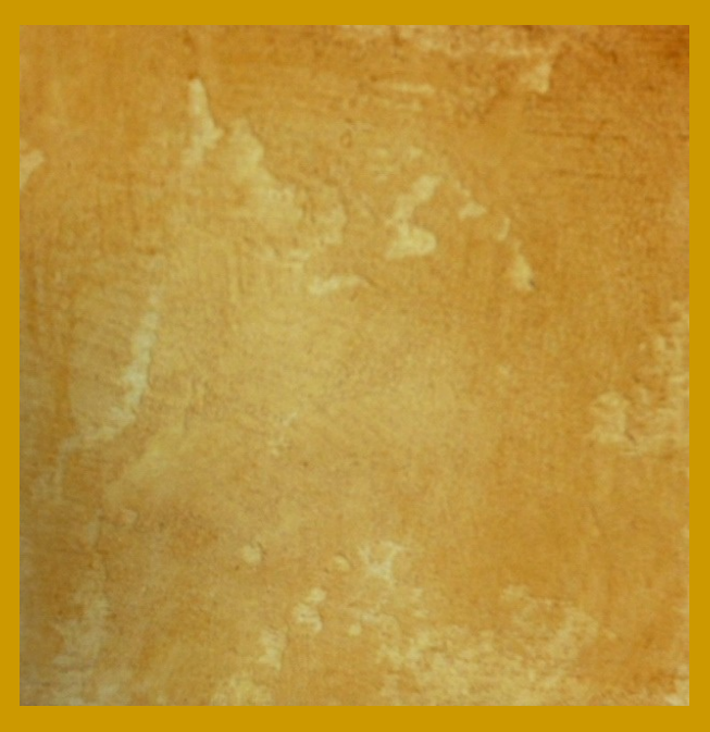
Fig 1: Background of Texture Crackle and colour washed with Traditions Raw Sienna