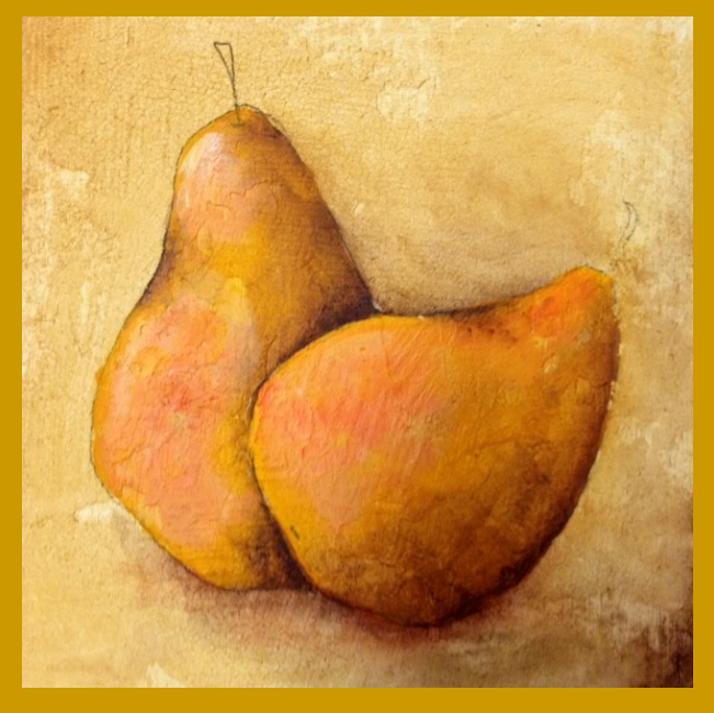
Fig 4: Add Shading to the pears with Burnt Umber and a blush to the Belly and neck of the pears with Perinone Orange.