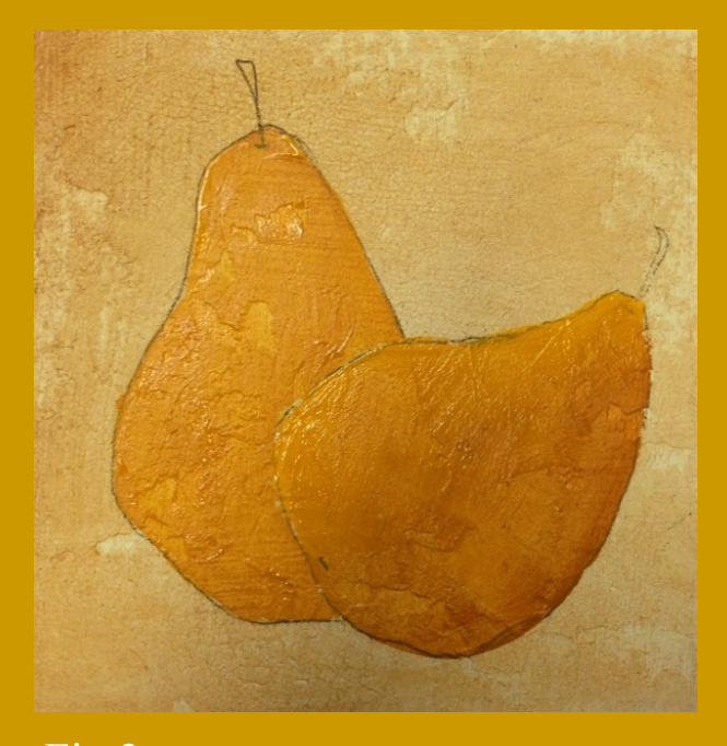
Fig 2: Pears are based with Yellow Deep on the right and Indian Yellow on the Left