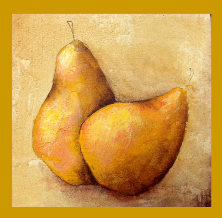
Fig6: Begin adding the highlights by applying the darker value of the Indian Yellow

Fig 5: Brush Mix three Values of the Indian Yellow . By adding small quantities of Warm White . Mix the darker value first then create a second by adding more white then th third, by adding White to the second.