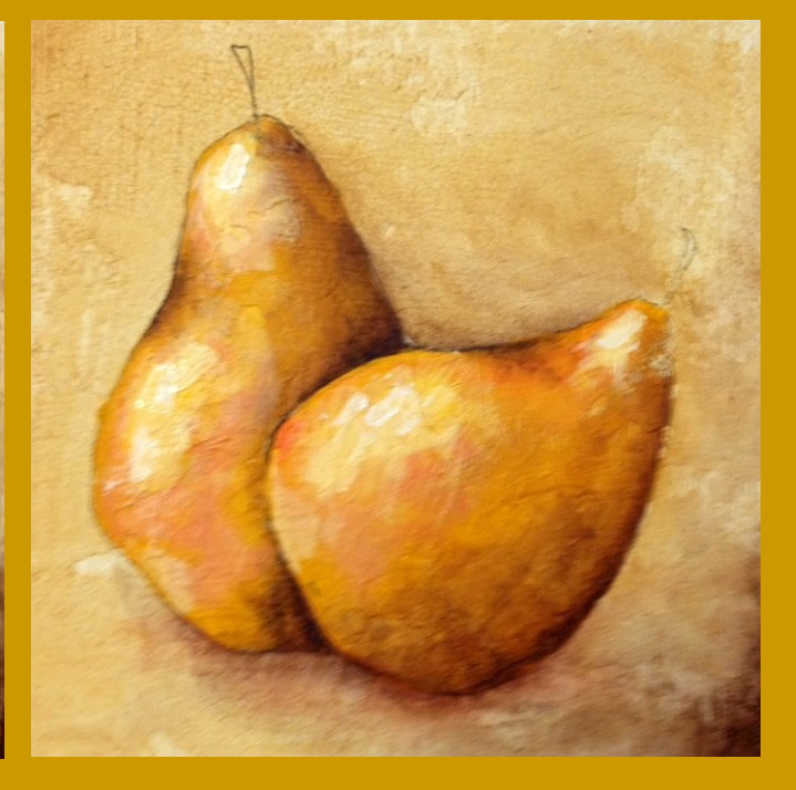
Fig 8: Apply a smaller highlight, using the lightest value of the Indian Yellow Mix

Fig 7: Brighten the highlight by Adding the Mid value of the Indian Yellow mix