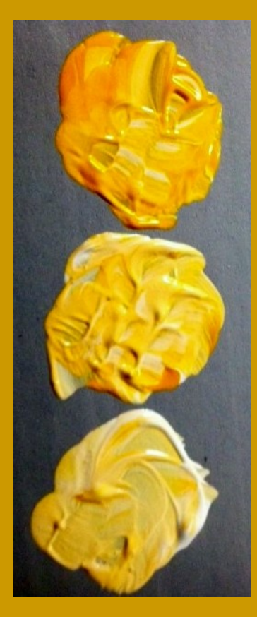
Fig 5: Brush Mix three Values of the Indian Yellow . By adding small quantities of Warm White . Mix the darker value first then create a second by adding more white then th third, by adding White to the second.