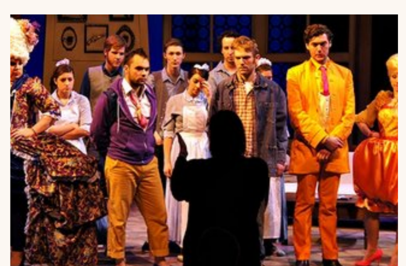
5 Ways You Can Be a Better Director Jun 16, 2020

Click Here To Sign Up for the OnStage Blog Newsletter