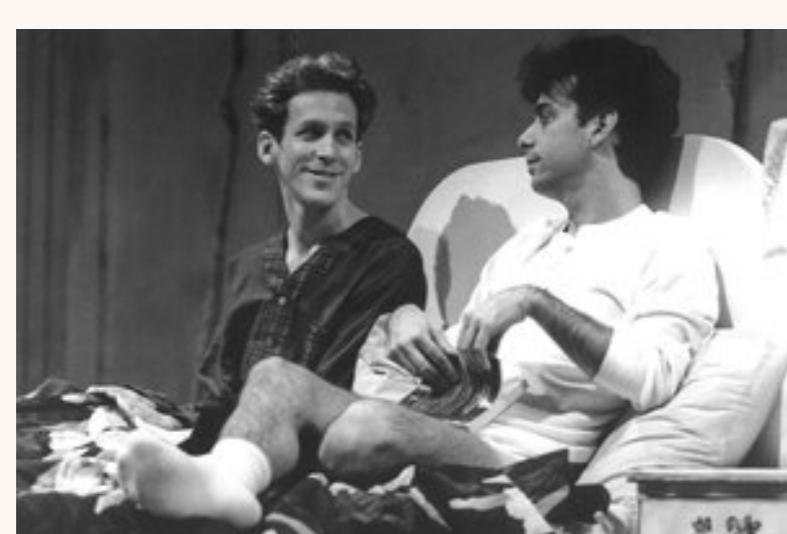
The Lasting Impact of Angels in America Jun 16, 2020