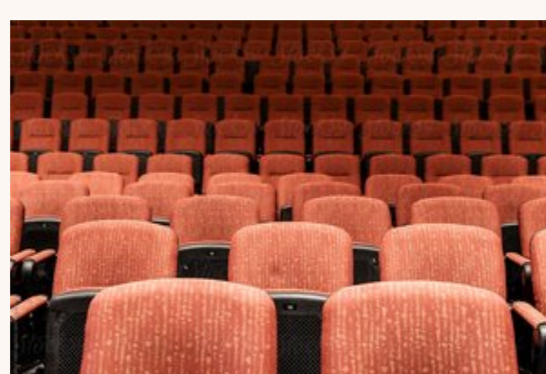
Lying About Your Conflicts is One of the Worst Things You Can Do to Your Show Jun 16, 2020