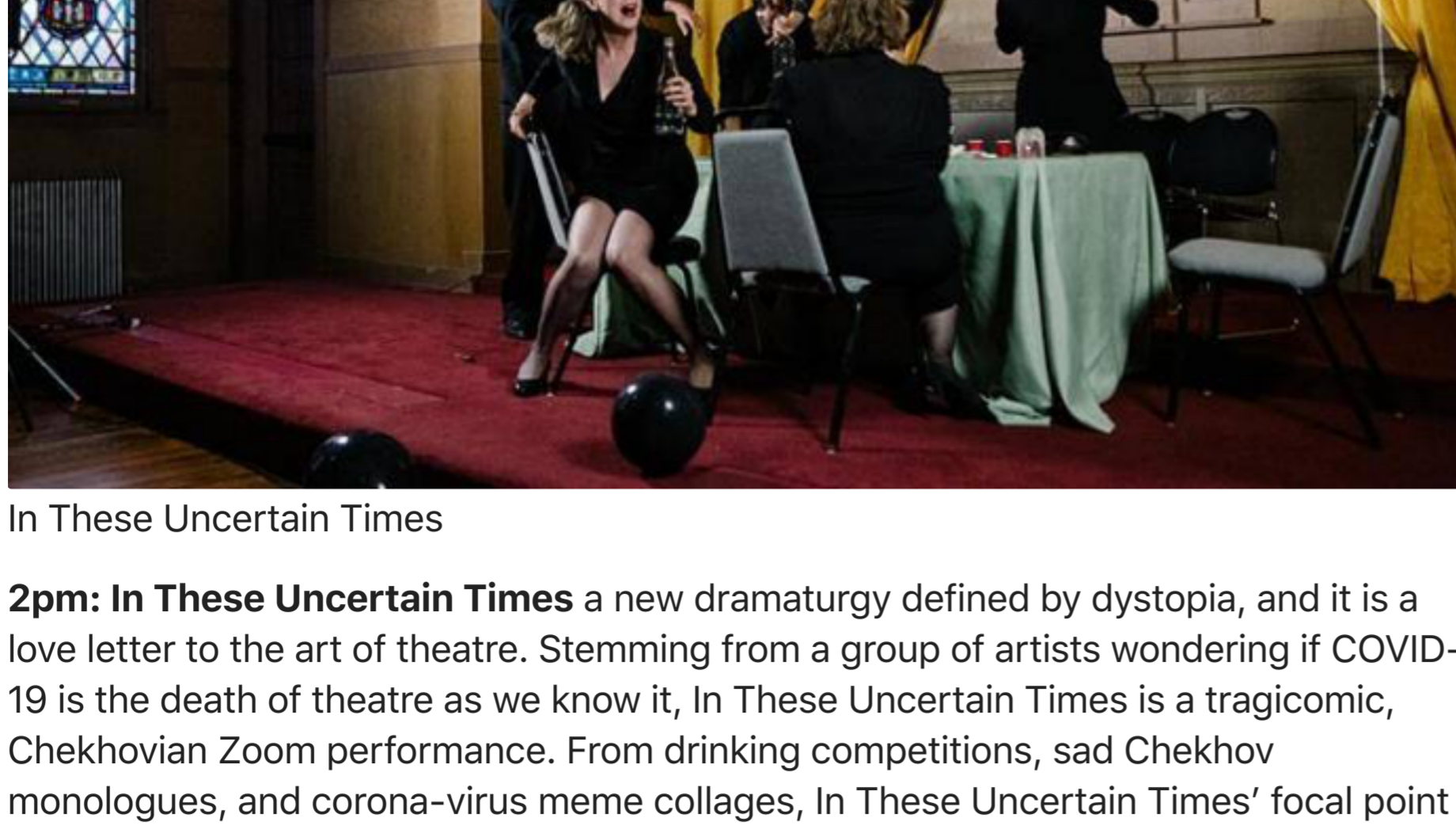
In These Uncertain Times