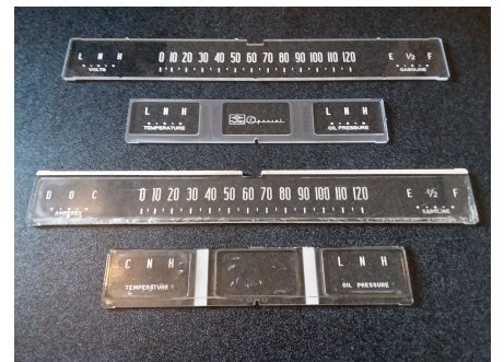
The new modified version in comparison with the original worn out and stress cracked gauge faces.

Some other things to note when modifying a cluster is during the assembly process. gauges must be installed and calibrated so the needle sweeps correctly. This cluster