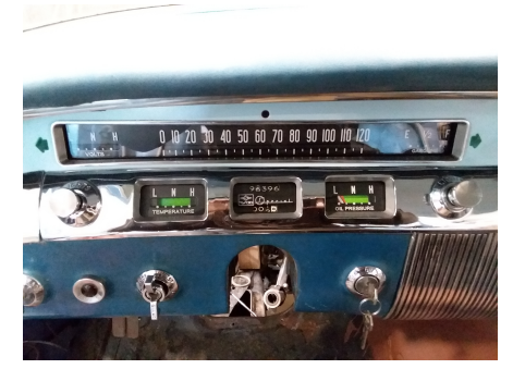
Completed cluster installed in the dashboard of a 1956 Buick Special.