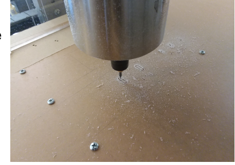
The delicate process of machining the gauge face in a mirror image. The work surface must be dead flat in order to get a quality optical appearance.

After the machining process is completed, the parts are then cleaned and inspected. The text and all markings are painted by hand with a special reflective paint. Lastly, a polishing process is performed, and the new cluster face is ready to install.