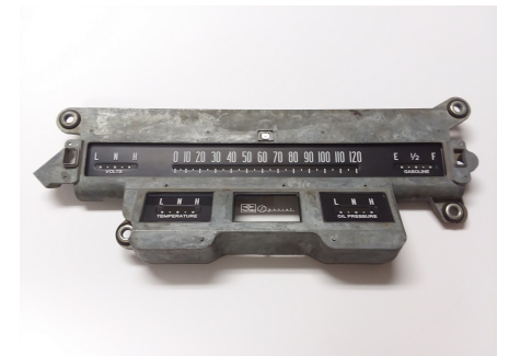
The assembled cluster shell with subtle changes while retaining the original look. The new sheen and clarity will draw your attention.

If you are looking to have restoration or modifications done to your cluster, feel free to email info@12voltconnection.com. Send a picture of your cluster and give a description of the type of work you are looking for.