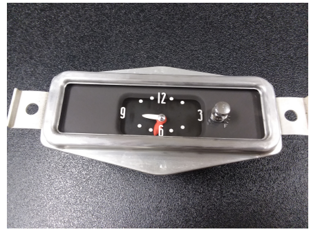
The clock, which was seized up for decades, was also restored and got a new face using the same process.