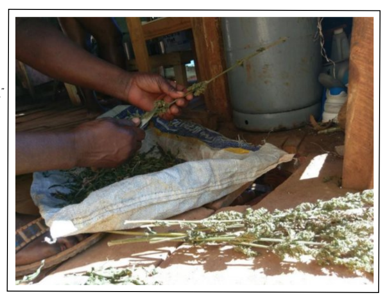
My host, preparing the harvest for town

"Yes, pretty." She laughed back. "Marijuana supports my family," she explained, caressing the stem slightly, "I love it!