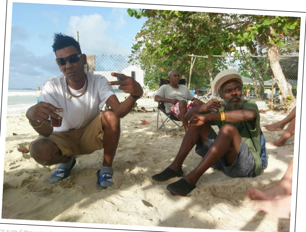
Not sure if they were here for the rum or the Coke...

"No, we don't want!" he firmly responded between sips of rum. "You have to be clear, or they never leave," he explained.