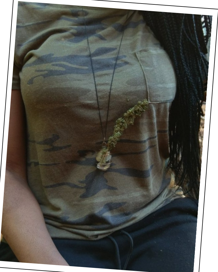
Yes, we mean everywhere...

"I'm going to walk up to that gas station..." he started. It was exactly what I needed to motivate me to move any more.