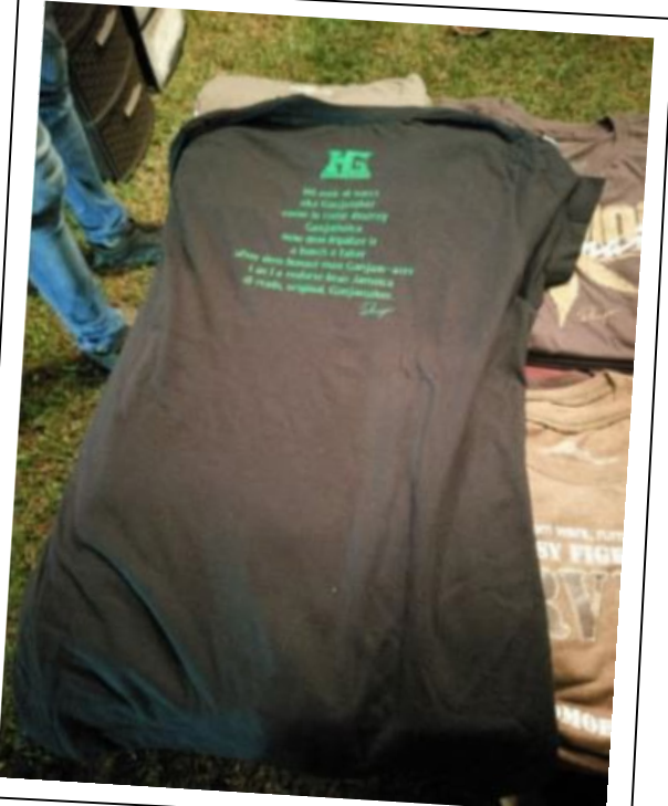
"I and I endorse bran Jamaica, di realis, original ganJamaker"

Marijuana is an herb that is celebrated and incorporated into their spiritual tradition. If any stoner saying can be credited to Jamaica, it would definitely be wake and bake.