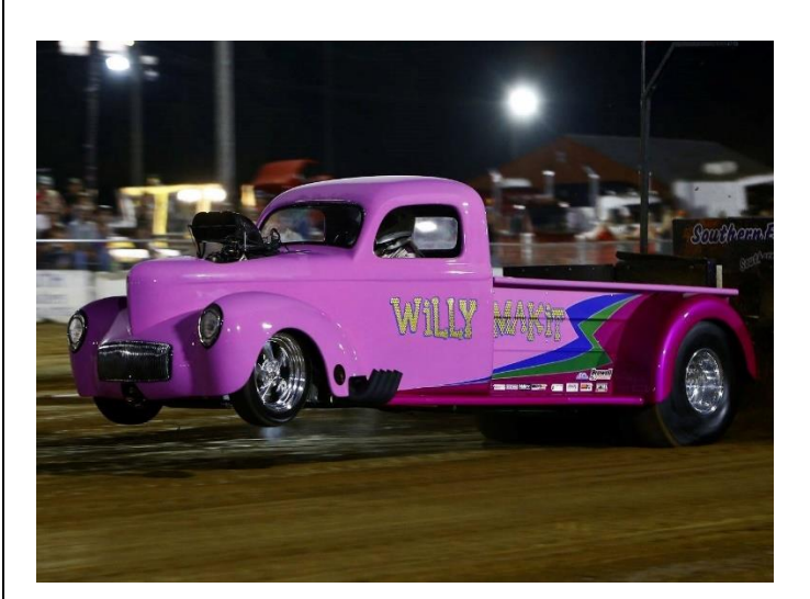
Light Weight Super Stock