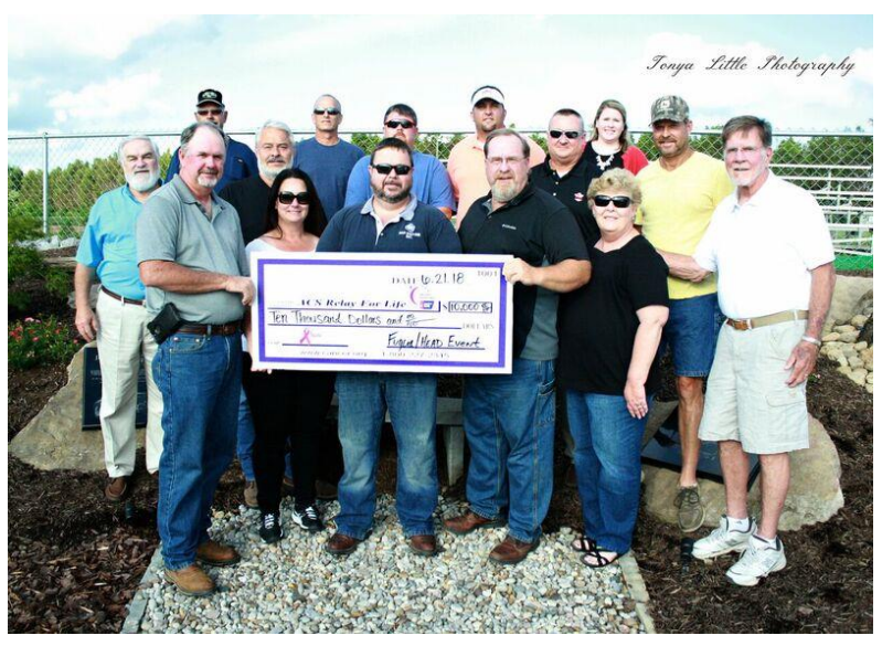
Promotors and Volunteers of Event