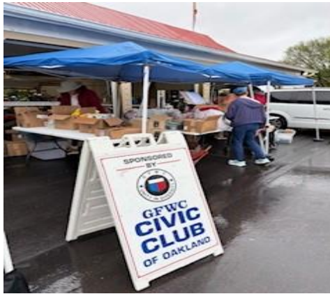
Outside the Anything Goes Flea Market

We had a LOT of items to fill our five Civic Club tables and had very little left that wasn't sold. Items that were not sold were donated to the two non-profits, the Nearly New and Garrett County Habitat for Humanity. So, not much went to waste.