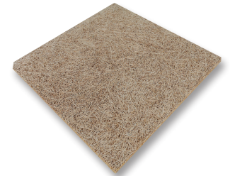
23.75" x 23.75"