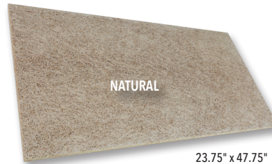
23.75" x 47.75"