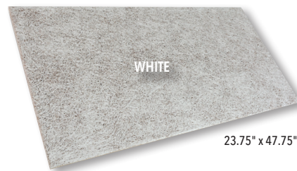
23.75" x 47.75"