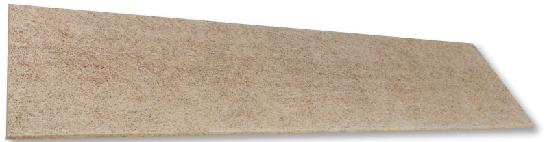
23.75" x 95.5"