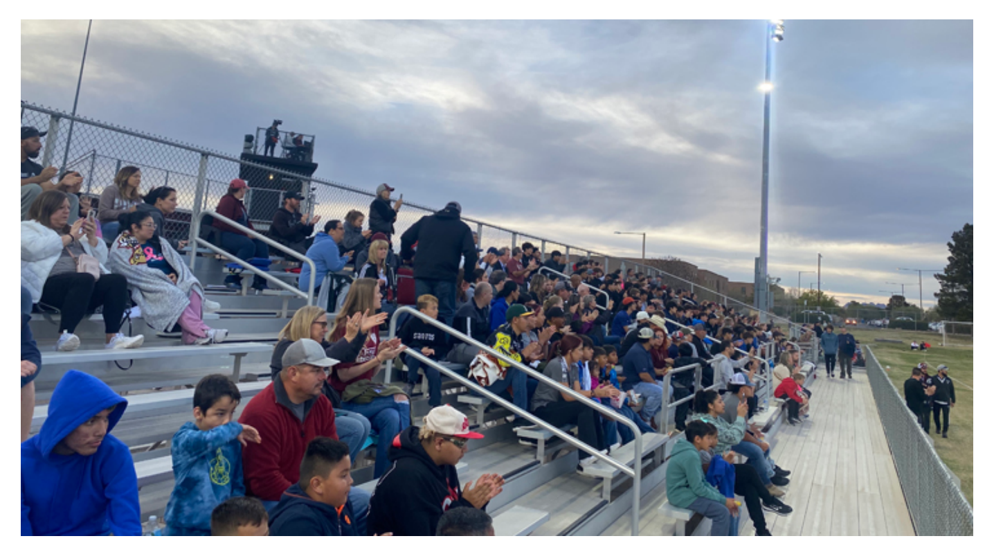
More than 500 fans came out to support UDA Soccer at New Mexico State University to see them play the Park City Red Wolves. It was the largest crowd the team has ever had for a game.

UDA at New Mexico State University made history Wednesday night beating Park City Red Wolves 1-0 in the First Round of the 2023 Lamar Hunt US Open Cup.