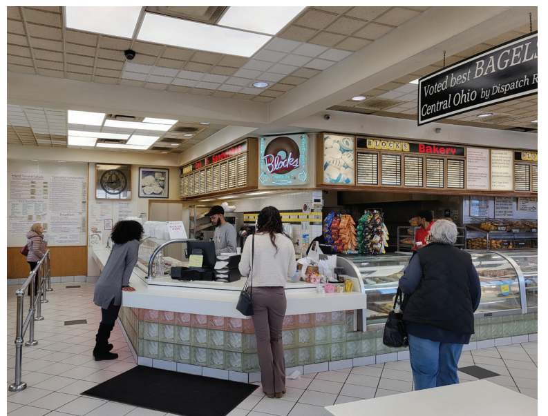
Block's Bagels today