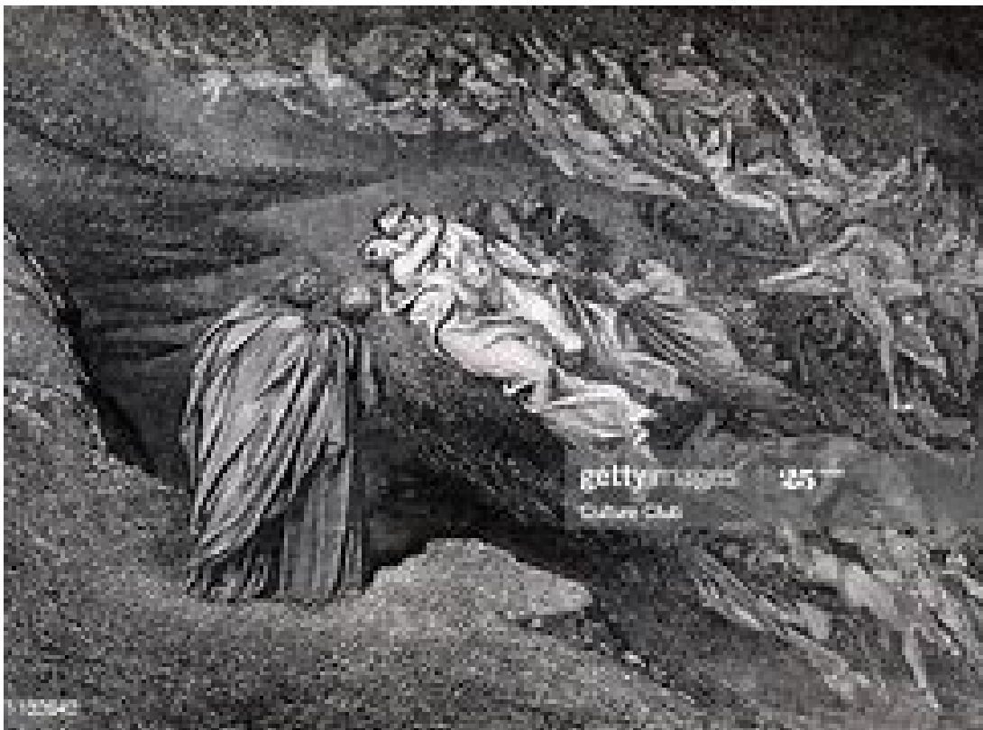
Inferno Canto 5: the lustful are swept up in a whirlwind.