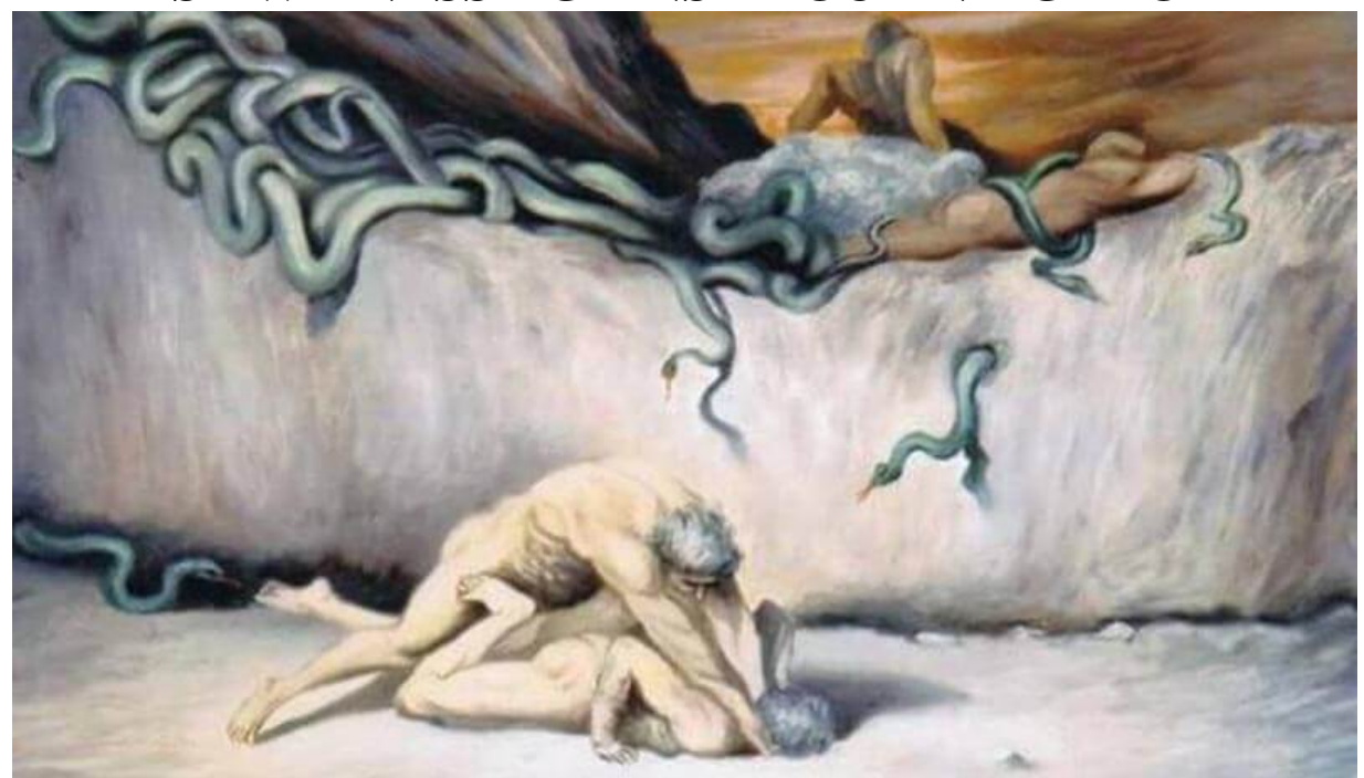
Inferno Canto 30: Impersonators run through hell attacking falsifiers