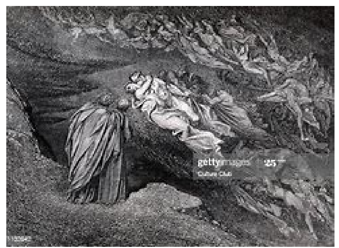
Inferno Canto 5: the lustful are swept up in a whirlwind.

• God created everything as an expression of his self-emptying love. The love of God is faithful and enduring.