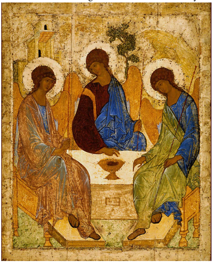
Hymn: Laus Trinitati is played during this contemplation