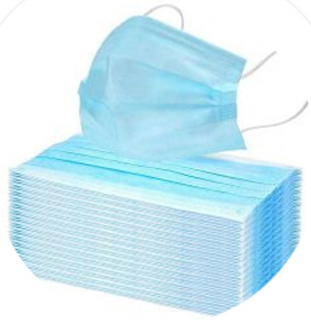
3 Ply MASK