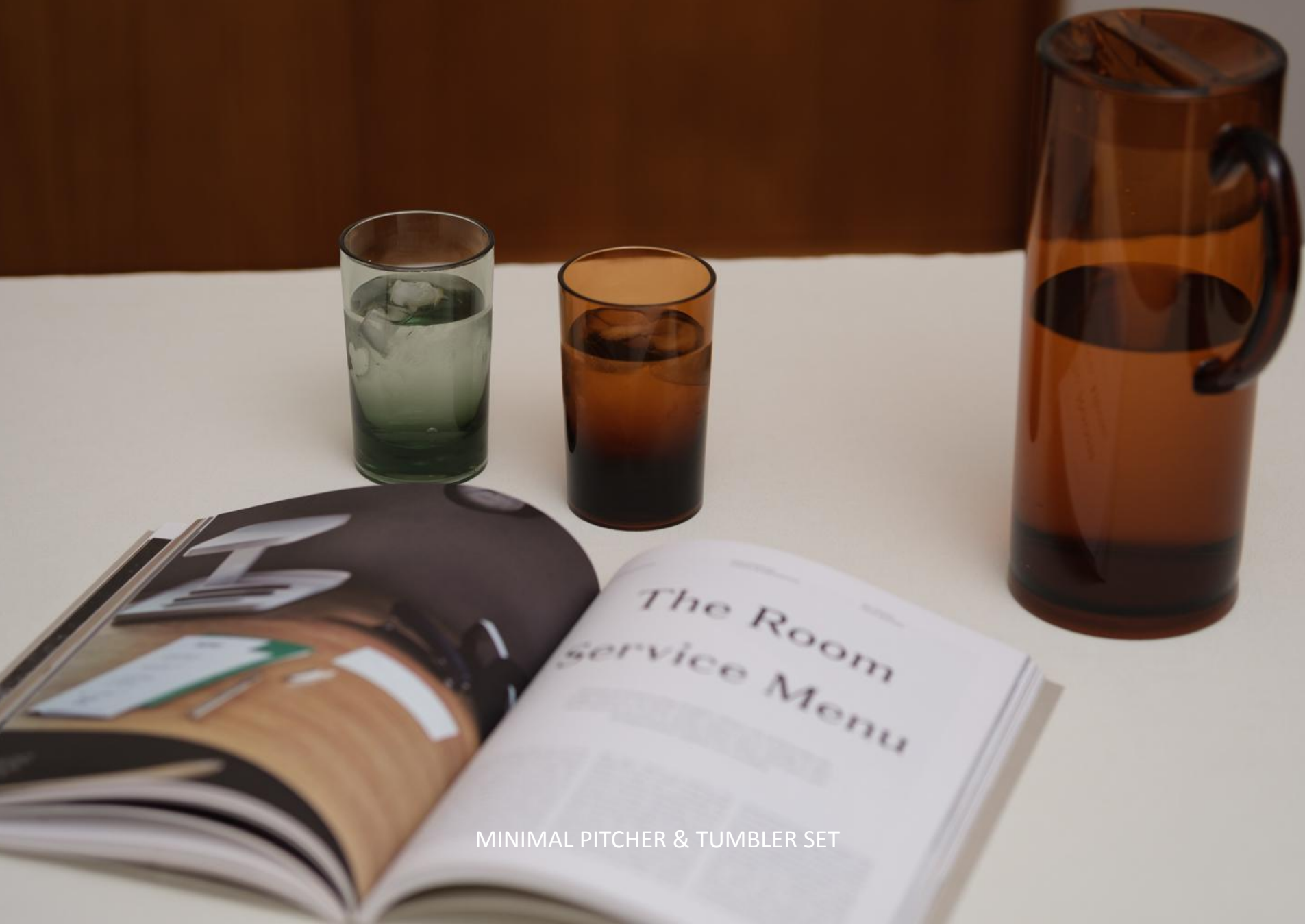
MINIMAL PITCHER & TUMBLER SET