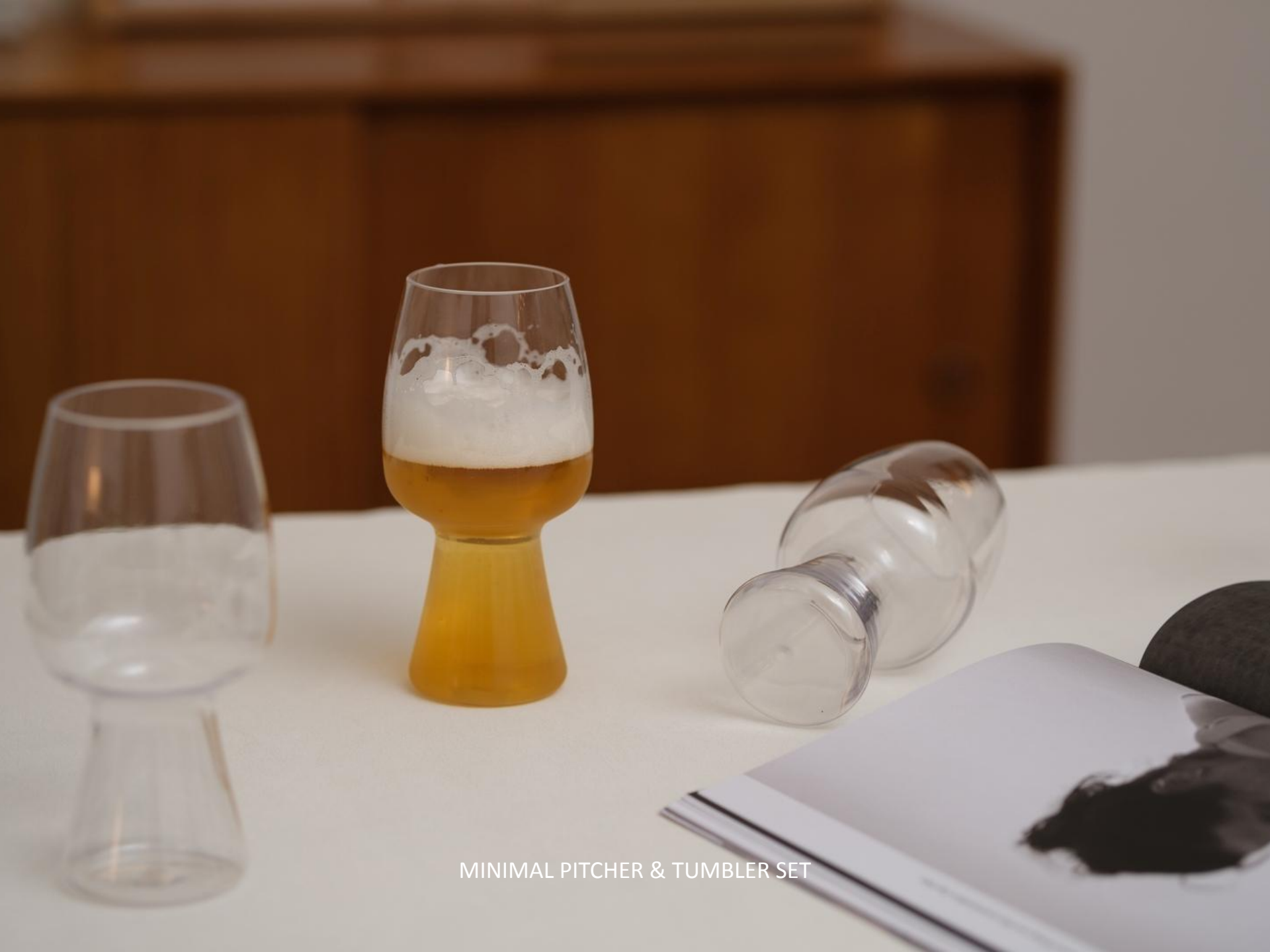
MINIMAL PITCHER & TUMBLER SET