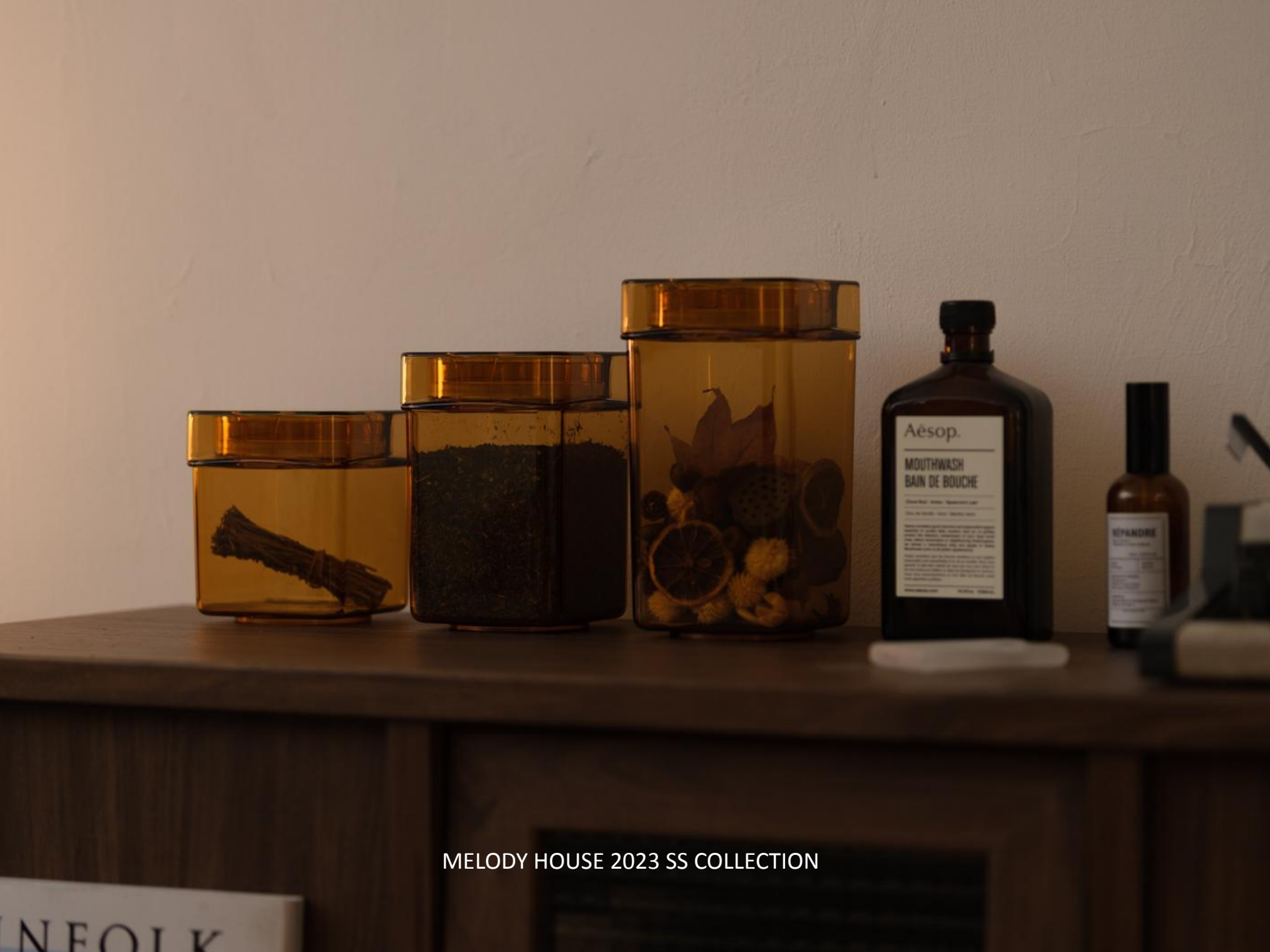
MELODY HOUSE 2023 SS COLLECTION