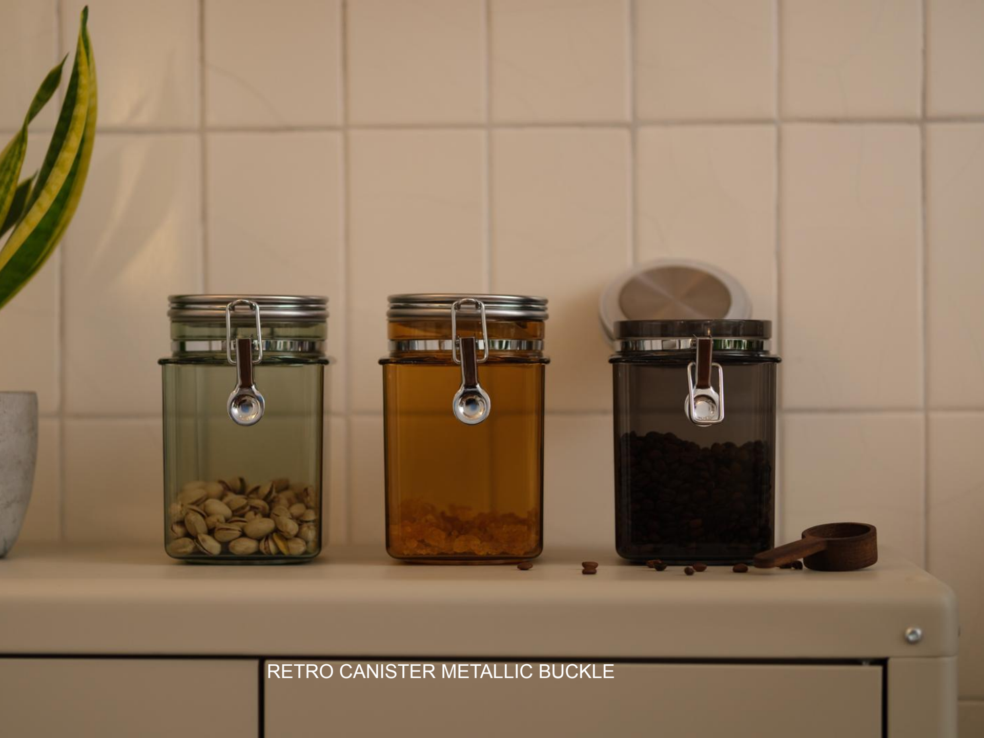
RETRO CANISTER METALLIC BUCKLE