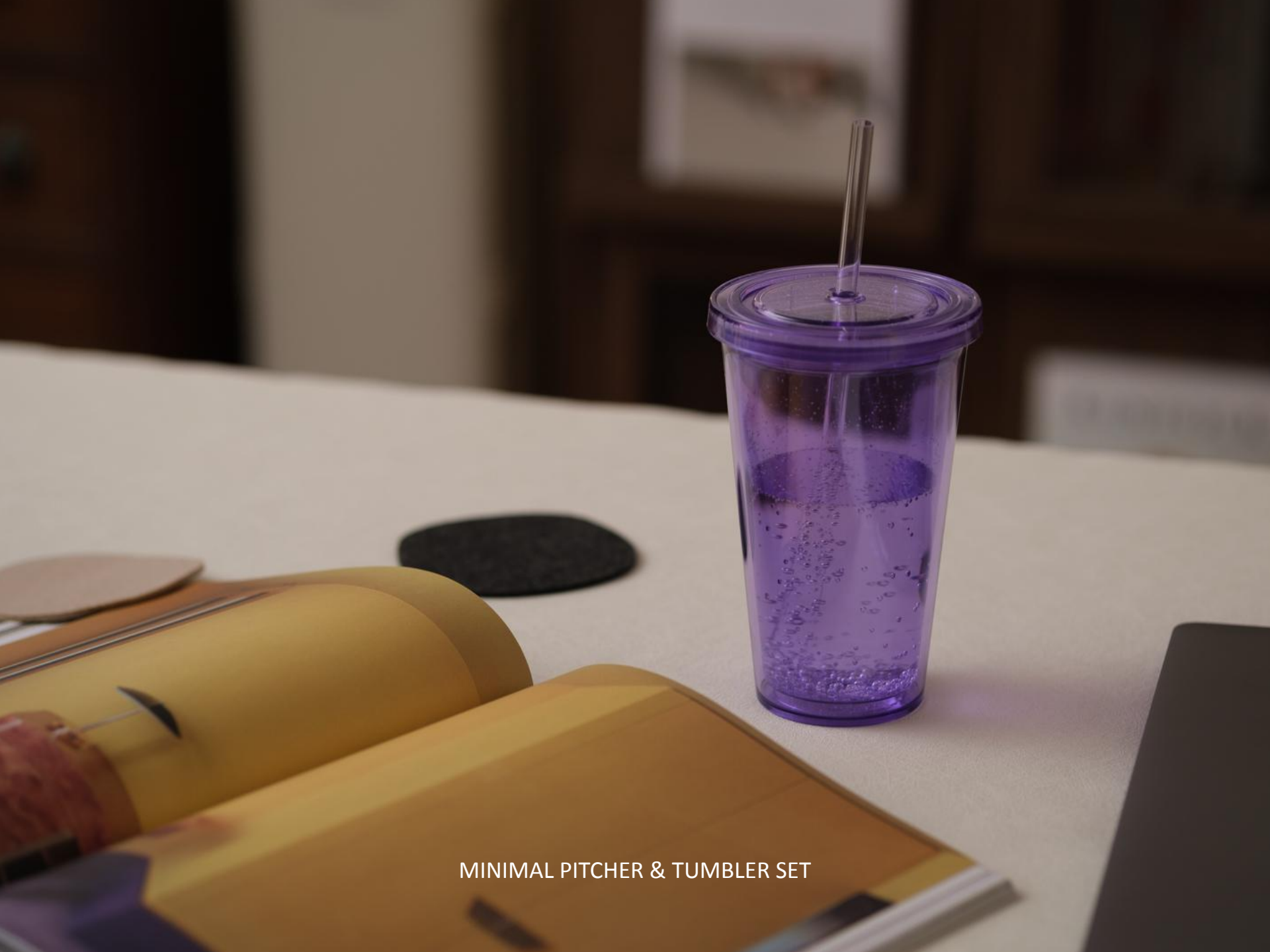
MINIMAL PITCHER & TUMBLER SET