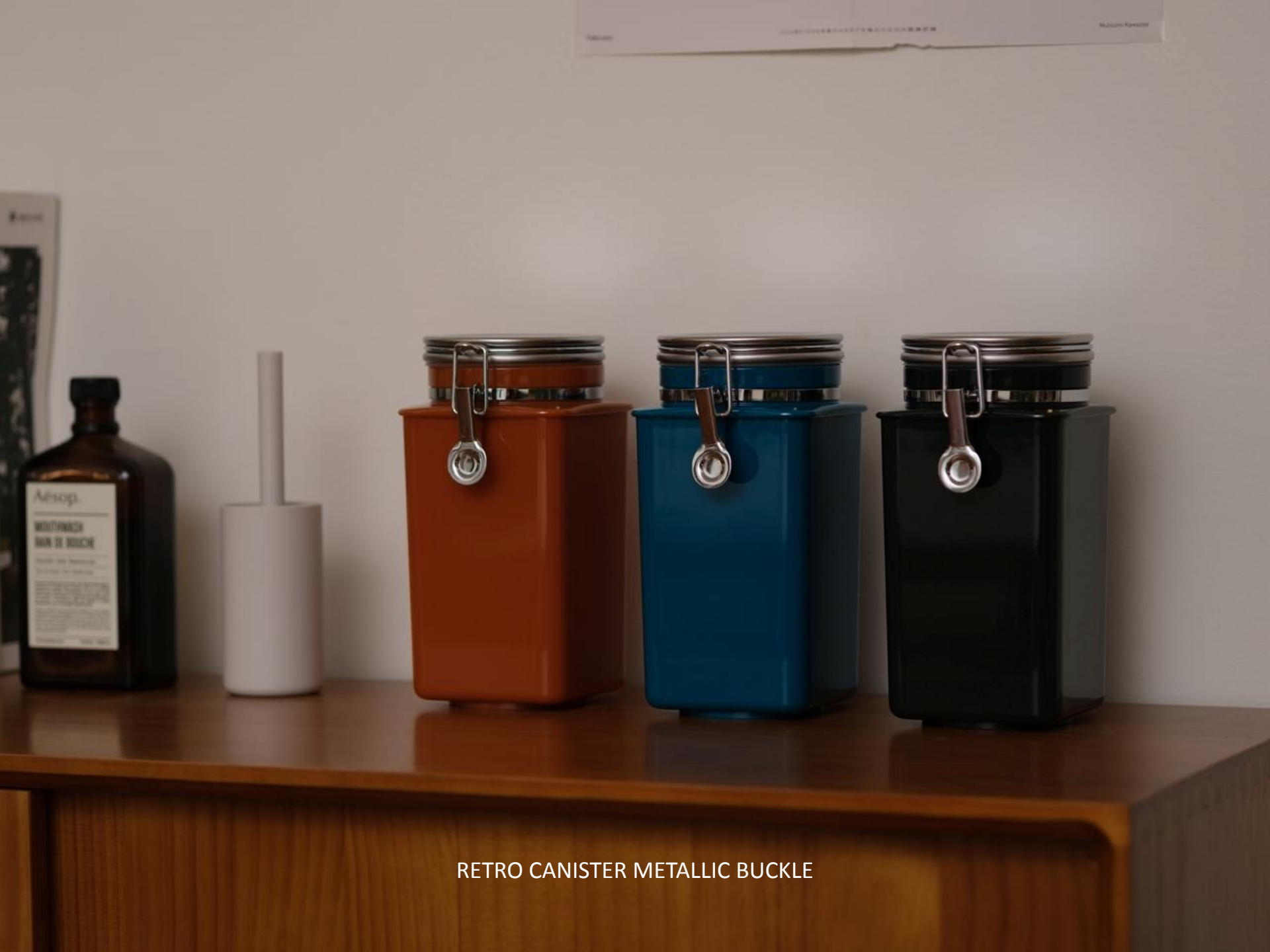
RETRO CANISTER METALLIC BUCKLE