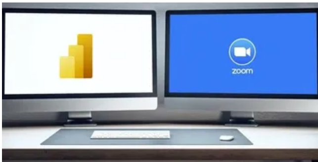
Online training in our Virtual Classrooms