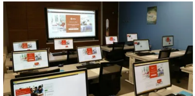
In-Person training in our Belfast City Centre Training Suites