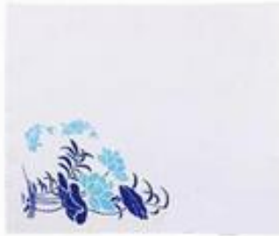
Silk Screen Printing