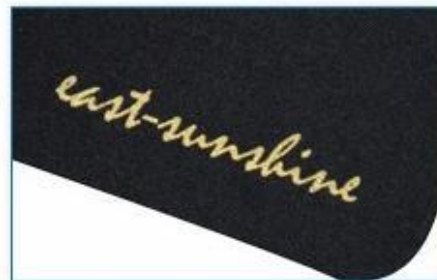
Screen Printing with Gold Powder