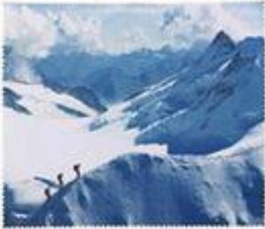
Hot Transfer Printing