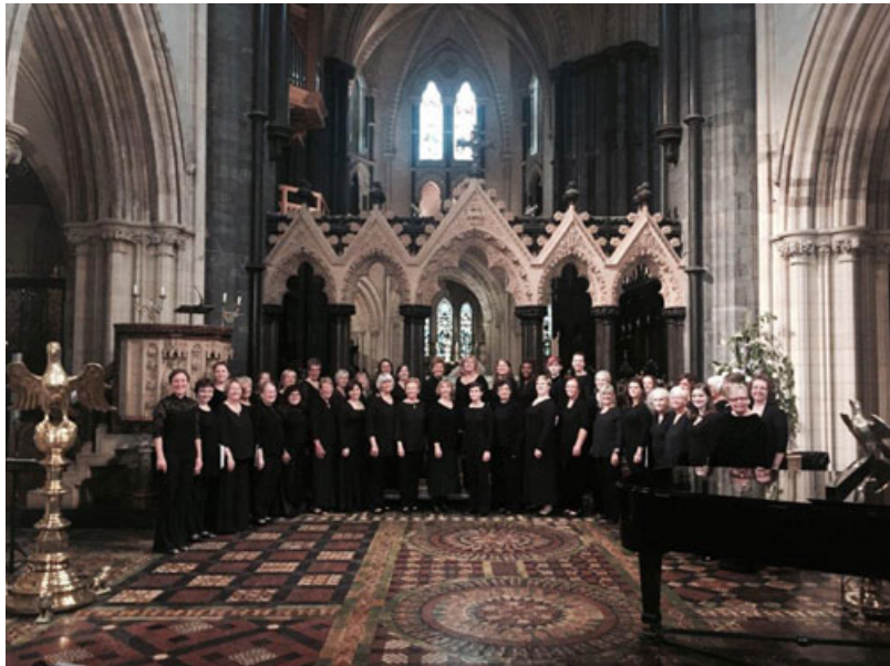
The full alumnae choir in Christ Church Cathedral.