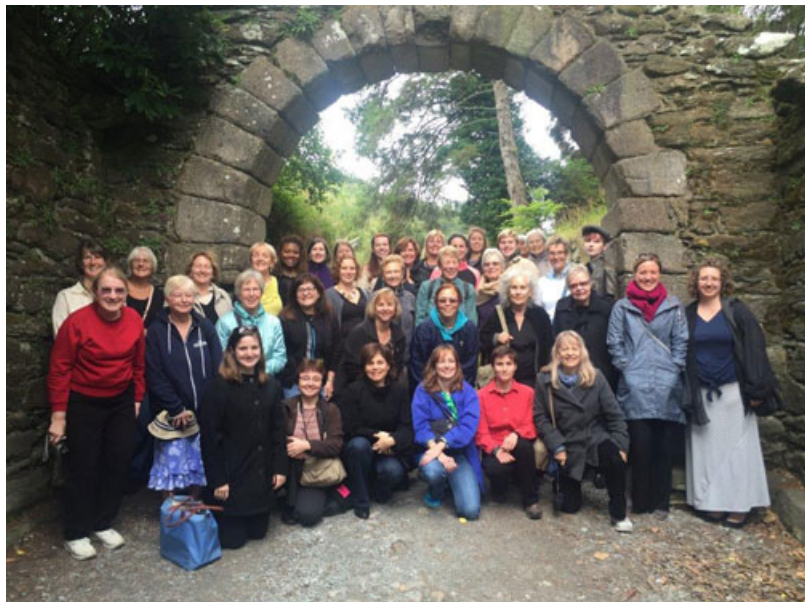
The entire alumnae choir at the Glendalough Ecclesiastical Settlement.