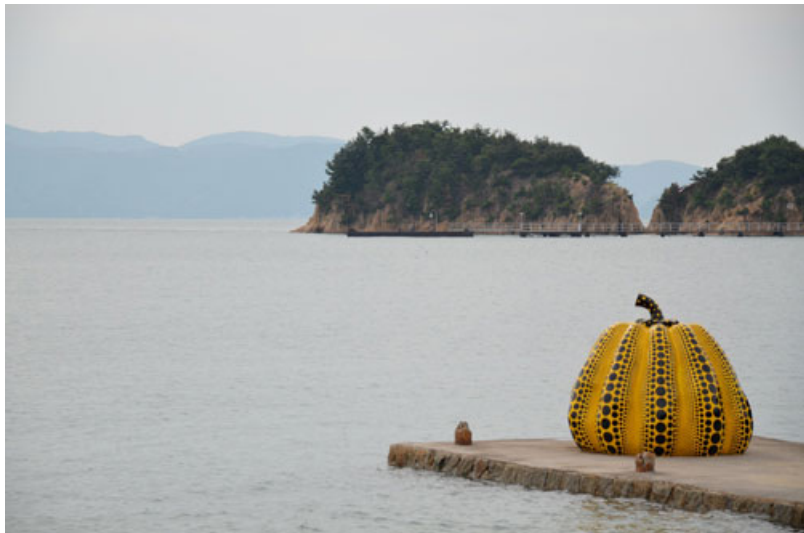
The Yellow Pumpkin is another art installation on Naoshima Island, the work of an 85-year-old purple-haired Japanese woman named Yayoi Kusama.