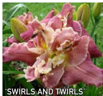
'SWIRLS AND TWIRLS'