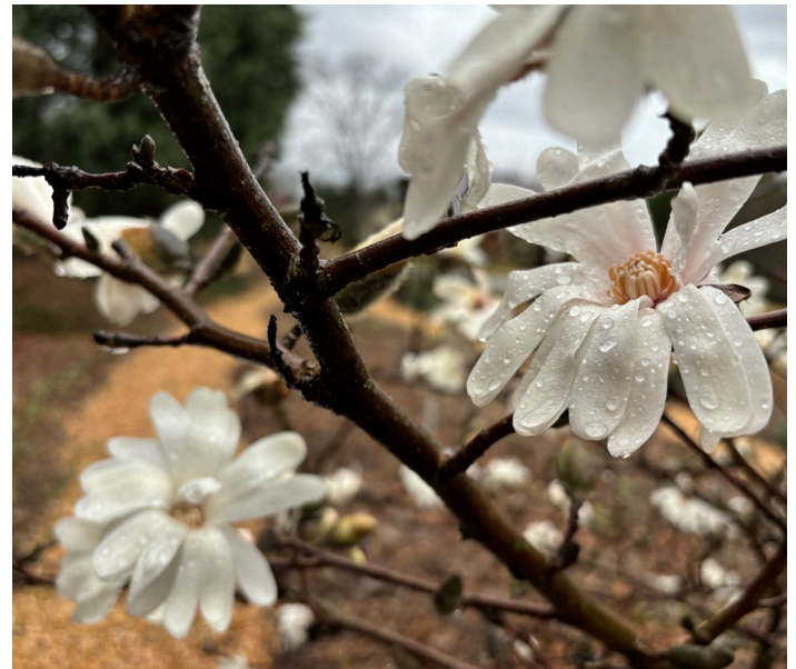
Star Magnolia in bloom at the display garden, February 2024.