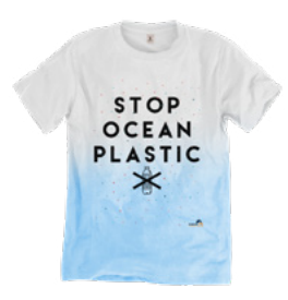
Organic cotton campaign t-shirt