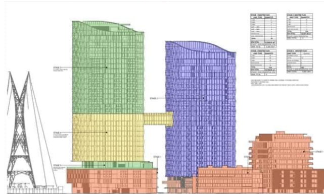
Proposed Kokoda Development, 17-27 Skyring Tce, Teneriffe Q 4005. Ref A006375195

* NOTE: If you made a submission prior to 24 Nov, you MUST submit another to be eligible