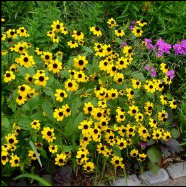
Trilobed Rudbeckia Rudbeckia triloba