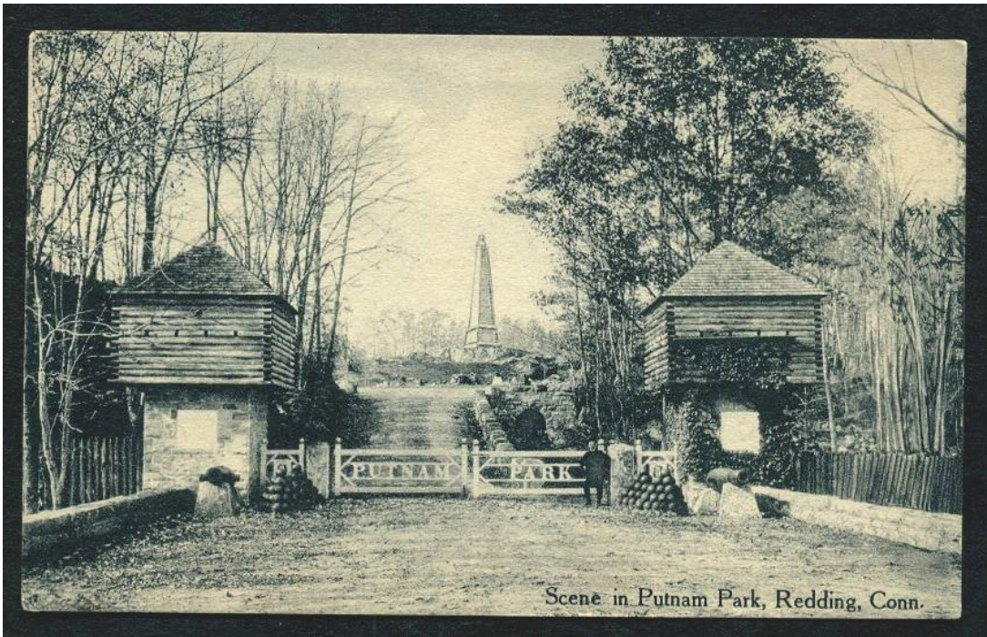
Scene in Putnam Park, Redding, Conn.