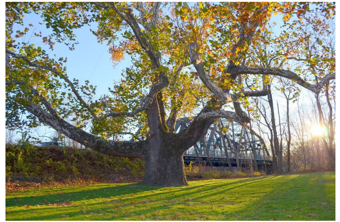
The Pinchot Sycamore, Simsbury, CT.