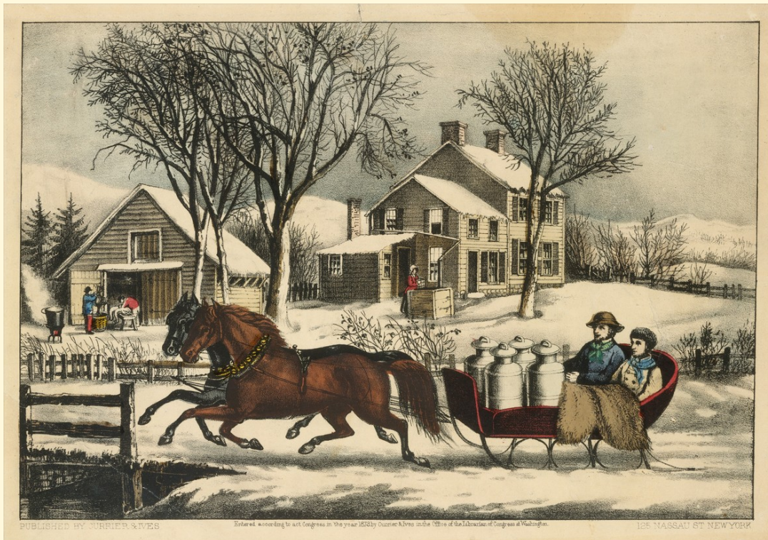
Winter Morning, Currier & Ives