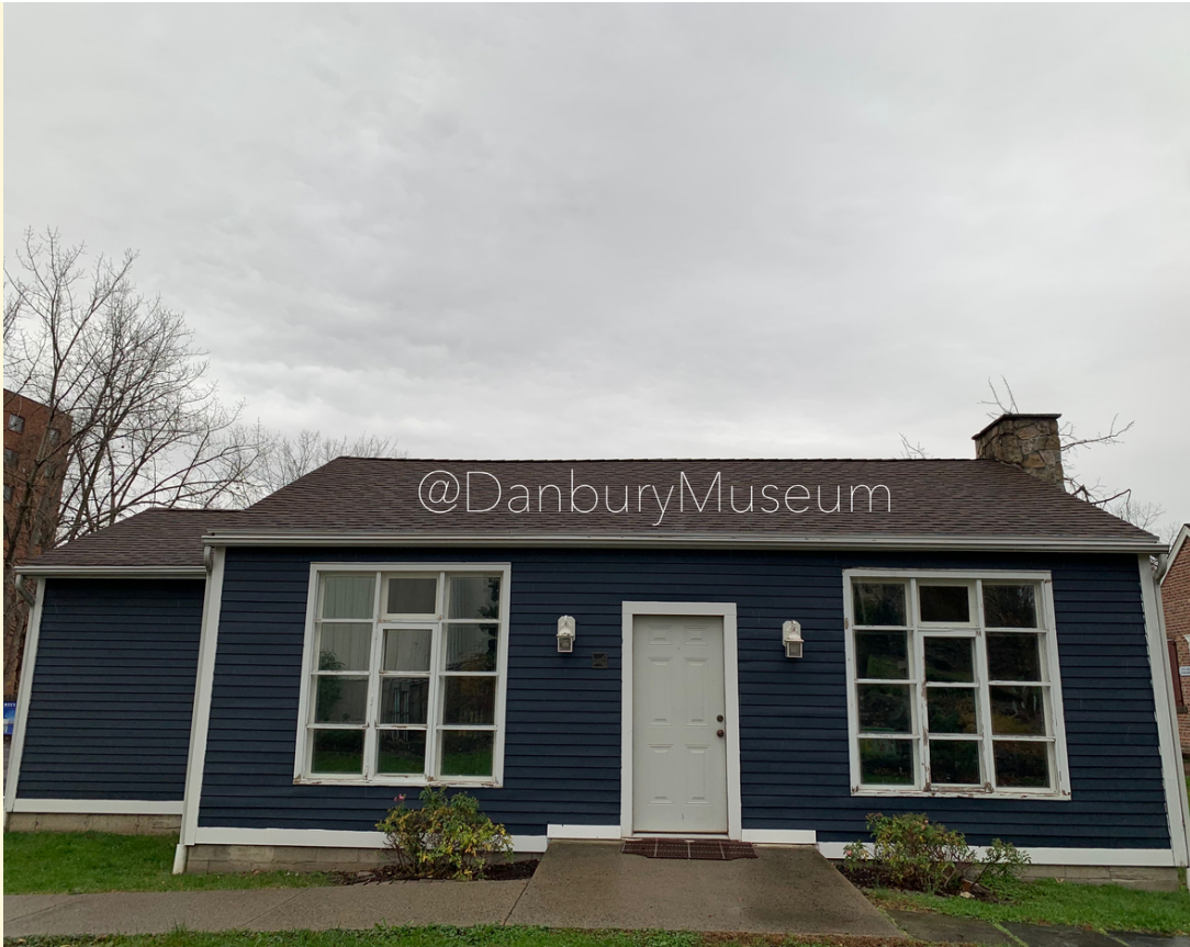
The front of the Anderson Studio fully painted with Hale Navy.