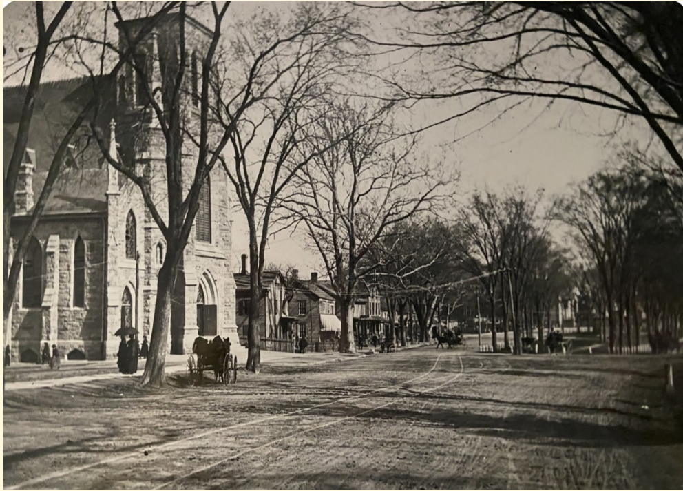
Main Street--St Peter's Church looking toward Elmwood Park.