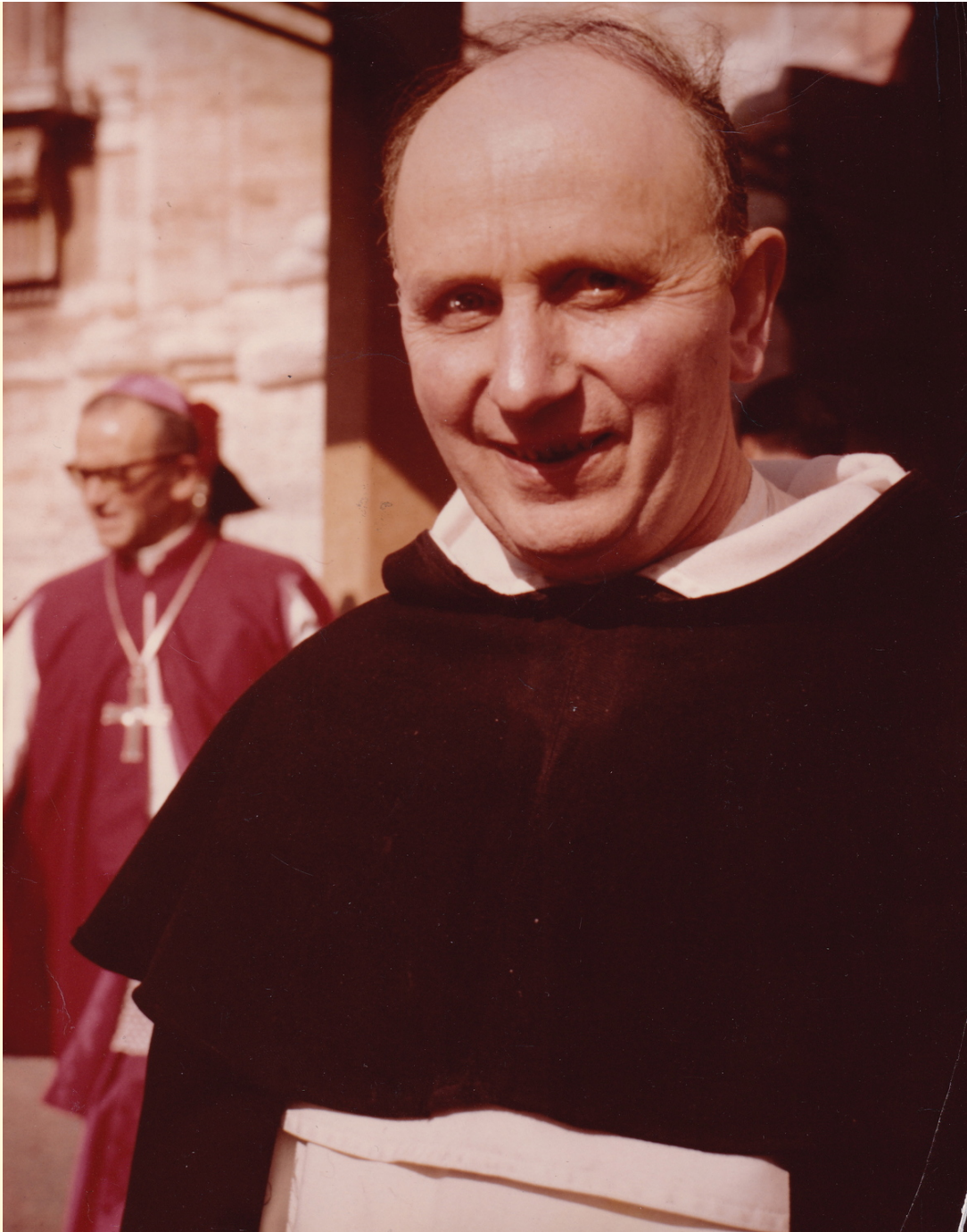
Yves Congar