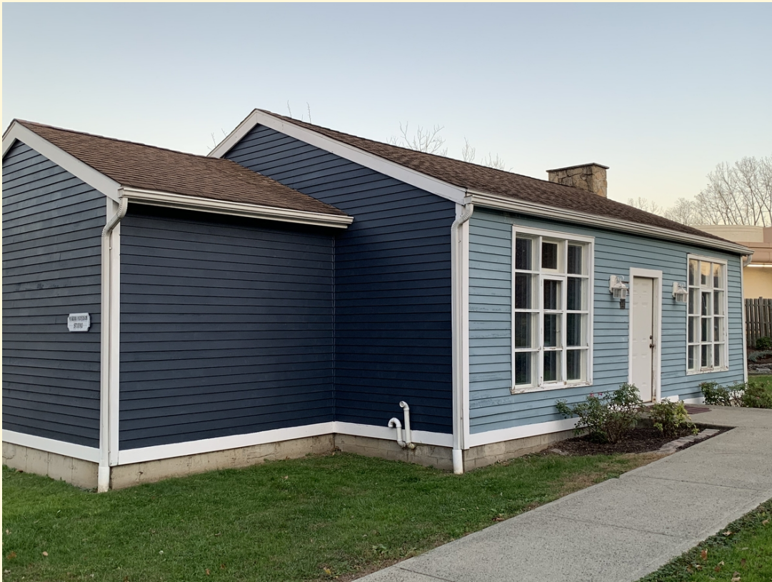
A little before and a little after as we repaint the Marian Anderson Studio.

We'll share more photos as the projects continue!