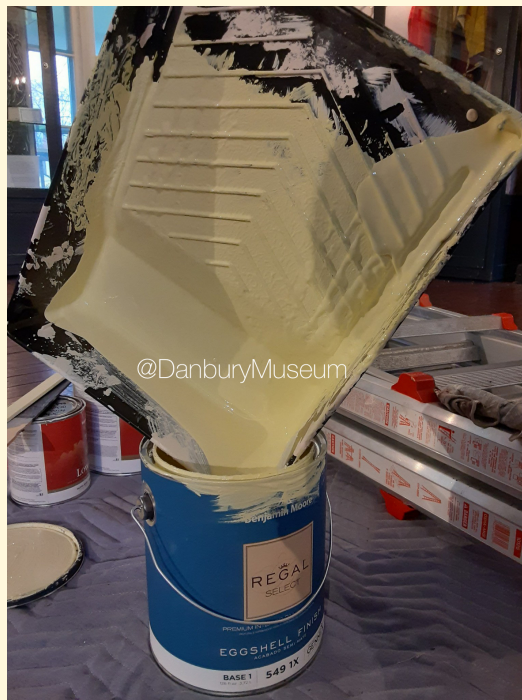
Buttery yellow will replace the lavender wall color inside the Marian Anderson Studio.