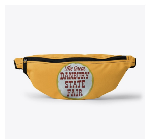
Great Danbury State Fair (Retro) Available in our TeeSpring online shop.