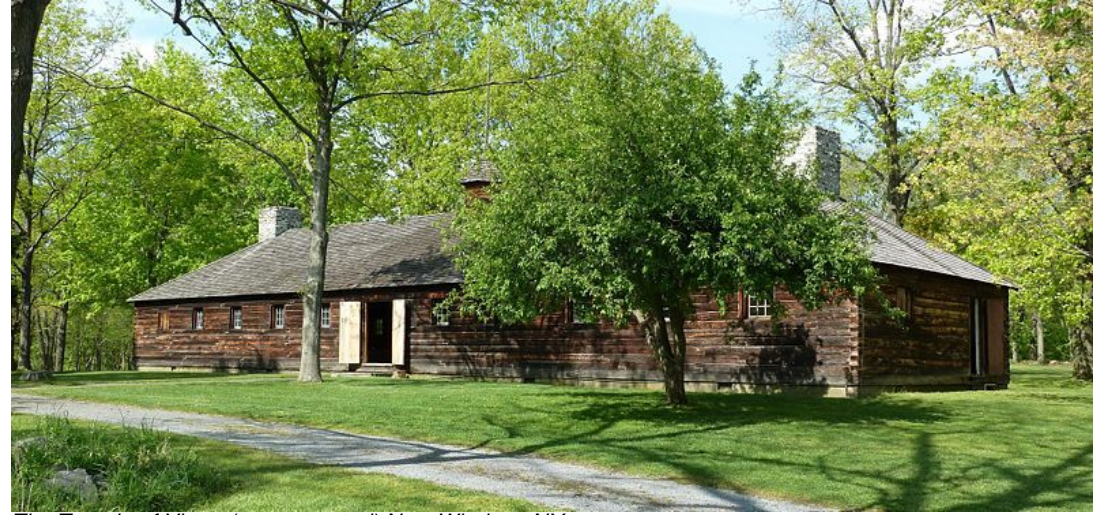
The Temple of Virtue (reconstructed) New Windsor, NY