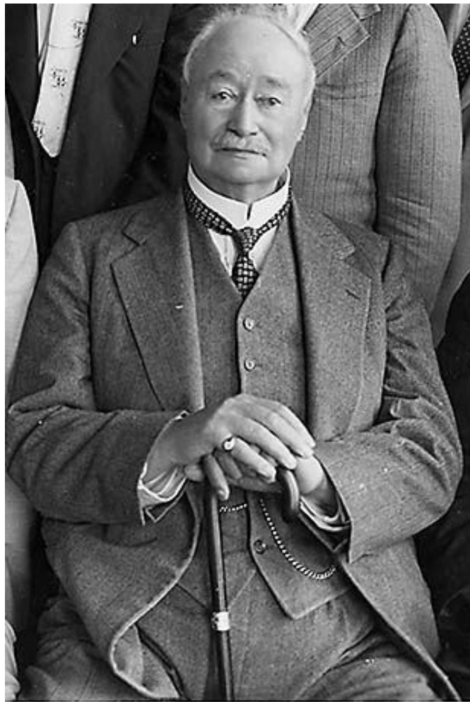
Sir Henry Pellatt ca 1936