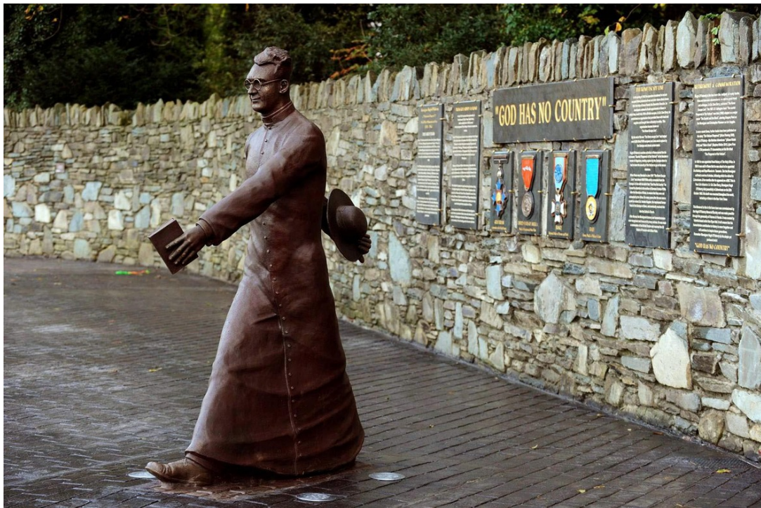
Hugh O'Flaherty Memorial in Killarney, County Kerry.