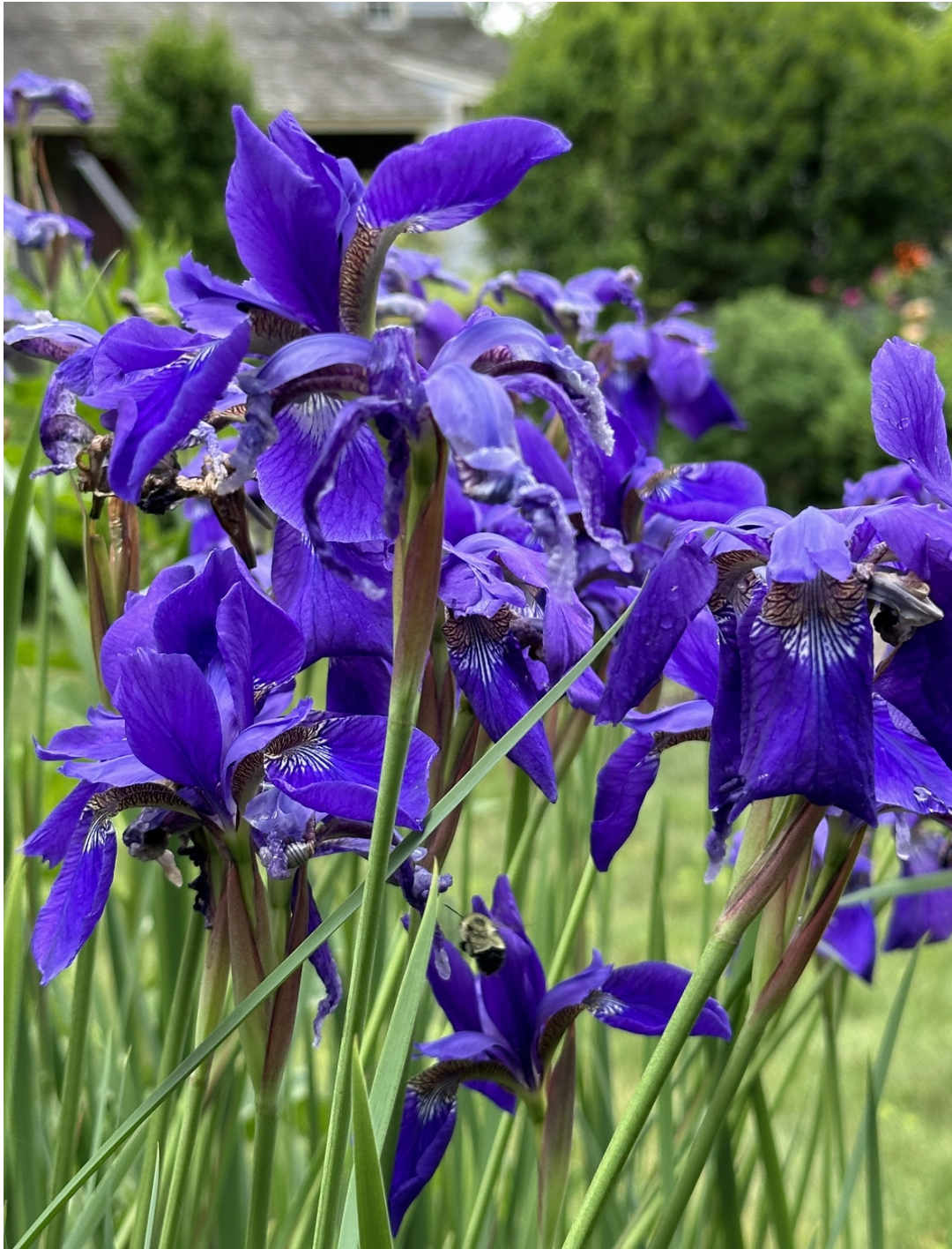
Siberian Irises in full bloom in the museum gardens!