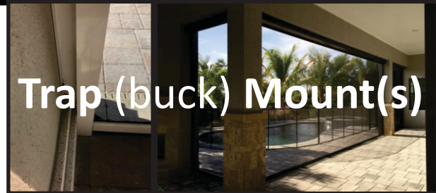
Trap (buck) Mount(s)