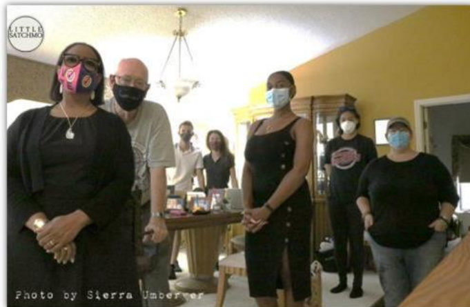
"Little Satchmo" Documentary – Florida Unit