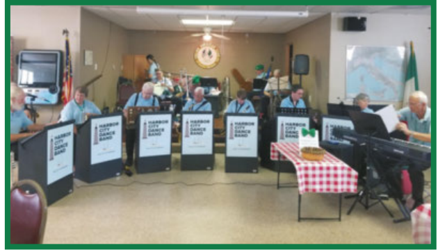
Entertainment provided by Harbor City Dance Band

Our Italian-inspired May dinner will be on Friday, May 6 and tickets will go on sale April 4.