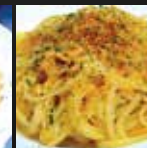
Classic Aglio Olio