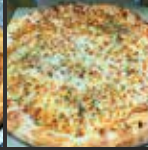
Garlic & Cheese