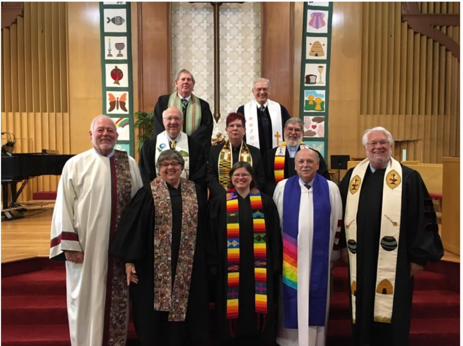
Picture taken at our 200th Anniversary Celebration taken in November 2019. It seems like years ago! All of the ministers pictured here have either served in ministry at Trinity or were ordained here!