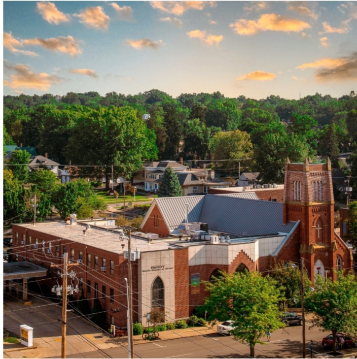
Trinity exists at the corner of North and Buckeye streets in downtown Wooster. Your continued support of our ministry is greatly appreciated!